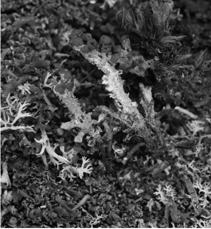
Cladonia cristatella (see front cover for colour)