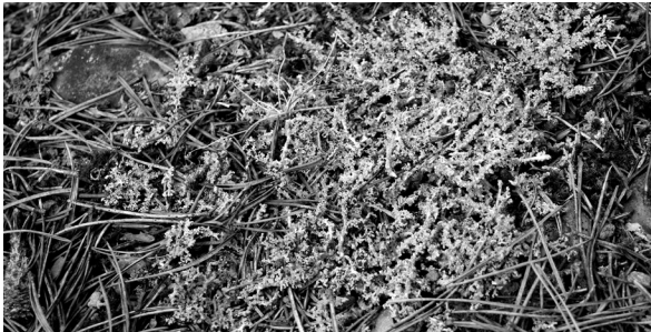
Stereocaulon tomentosum Bernard de Vries (see inside bottom - front cover for colour)