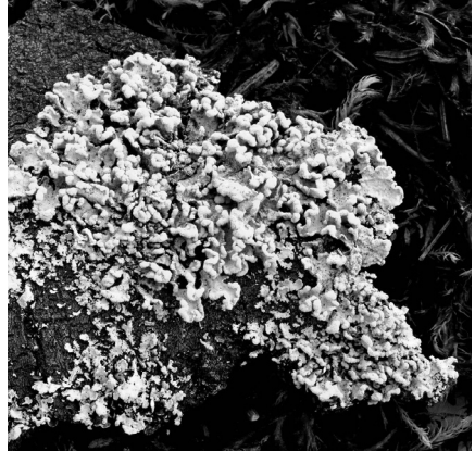
Vulpicida pinastri Bernard de Vries (see inside back cover for colour)