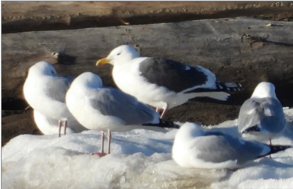
FIGURE 6. An adult Slaty-backed Gull, in breeding plumage, observed on 26 April 2023 at the west end of Bateman Island in the North Saskatchewan River in Prince Albert.

yellow and the hood [was] very distinctive.” The three other non-spring records for the province include one summer and two fall sightings. It will be upgraded to straggler status with future reports. The Hooded Warbler is a listed Threatened Species in Canada, but it has shown evidence of extending its range north in recent years. 3 Are the recent spring records of this warbler in Saskatchewan a reflection of this expansion trend?