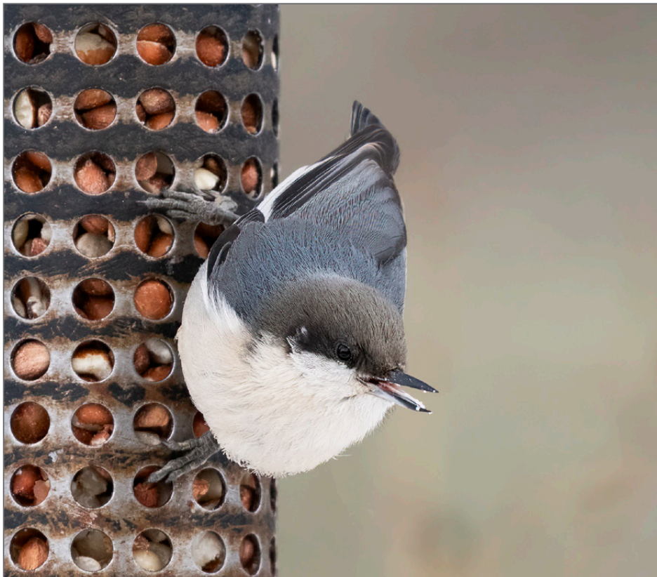
FIGURE 13. Saskatchewan's first confirmed record of Pygmy Nuthatch.

Barn Swallow ( Hirundo rustica ): on 10 April 2023, Don Weidl saw two at North Ekapo Lake, Qu'Appelle Valley "flying low over the frozen sewage lagoon" (eBird S133344113). Status: this matches the earliest arrival date in 1976 record from Regina.