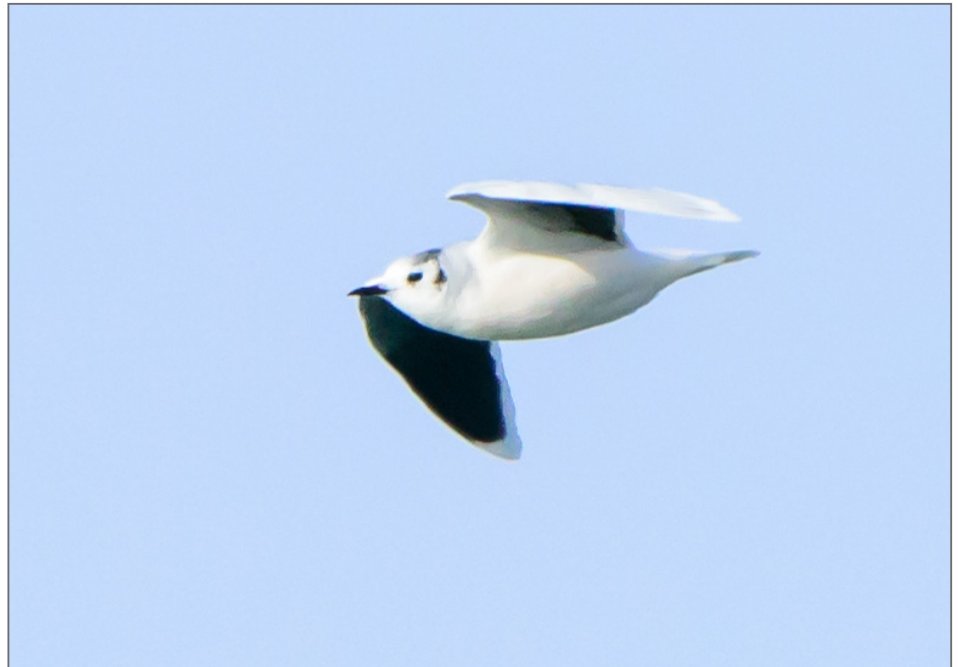
FIGURE 11. A Little Gull was observed in October 2023 in the Redberry Lake Migratory Bird Sanctuary.

south westerly direction to be discovered as vagrants in the prairies. This may be an example of "mirror-image misorientation" described by Howell et al. 49 Such birds have a faulty internal compass: young kittiwakes take an incorrect south westerly course rather than a normal south easterly course to traditional wintering grounds. The Black-legged Kittiwake is evaluated as 'Vulnerable' worldwide, due to a dramatic population decline of 40 per cent in recent decades. 50