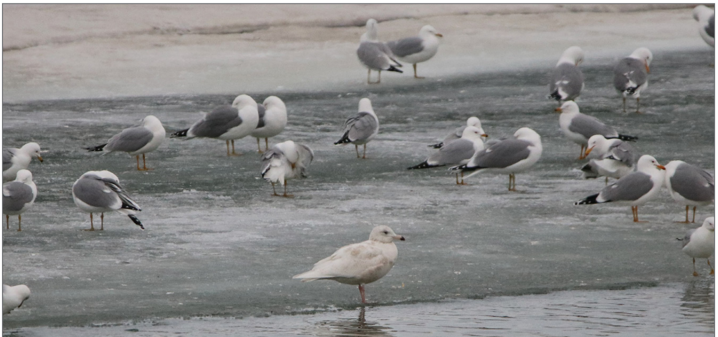
FIGURE 5. An immature Glaucous Gull on the ice of the South Saskatchewan River by the Queen Elizabeth II Power Plant, Saskatoon on 10 April 2023.

Hooded Warbler ( Setophaga citrina ): one male was seen by Bill MacKenzie in the Wildwood neighbourhood of Saskatoon on 10 May 2023 around 07:30 hr (fide Stan Shadick). It could not be relocated. Status: 10th record and seventh spring sighting for the province, which range from 9 May to 9 June. Accidental. Remarks: B Mackenzie "first noticed it on and around the bottom trunk of a large birch tree in our backyard. It then hunted around on the ground near the tree before leaving. I might have seen it for 20 to 30 seconds! But I did have an excellent view all that time. The bird was in the shade but bright