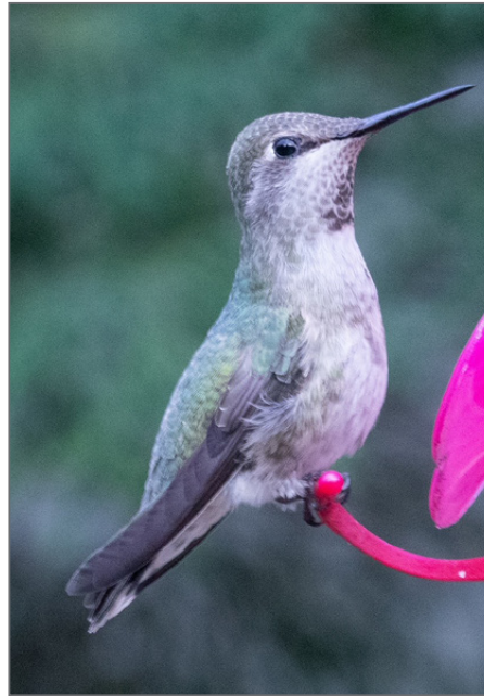
FIGURE 9. A single Anna's Hummingbird appeared in the yard of Murray and Cindy Koob in Crescent Heights, Prince Albert on 13 October 2023, lasting several days.

involved vagrants that stayed for extended periods of time — one summer record lasting 48 days, and two fall records of 17 and 36 days. 1,2 Late fall vagrant hummingbirds are not expected to survive our cold fall weather even with supplemental feeding. Attempts to “rescue” these birds require permits and though well intentioned are usually unsuccessful.