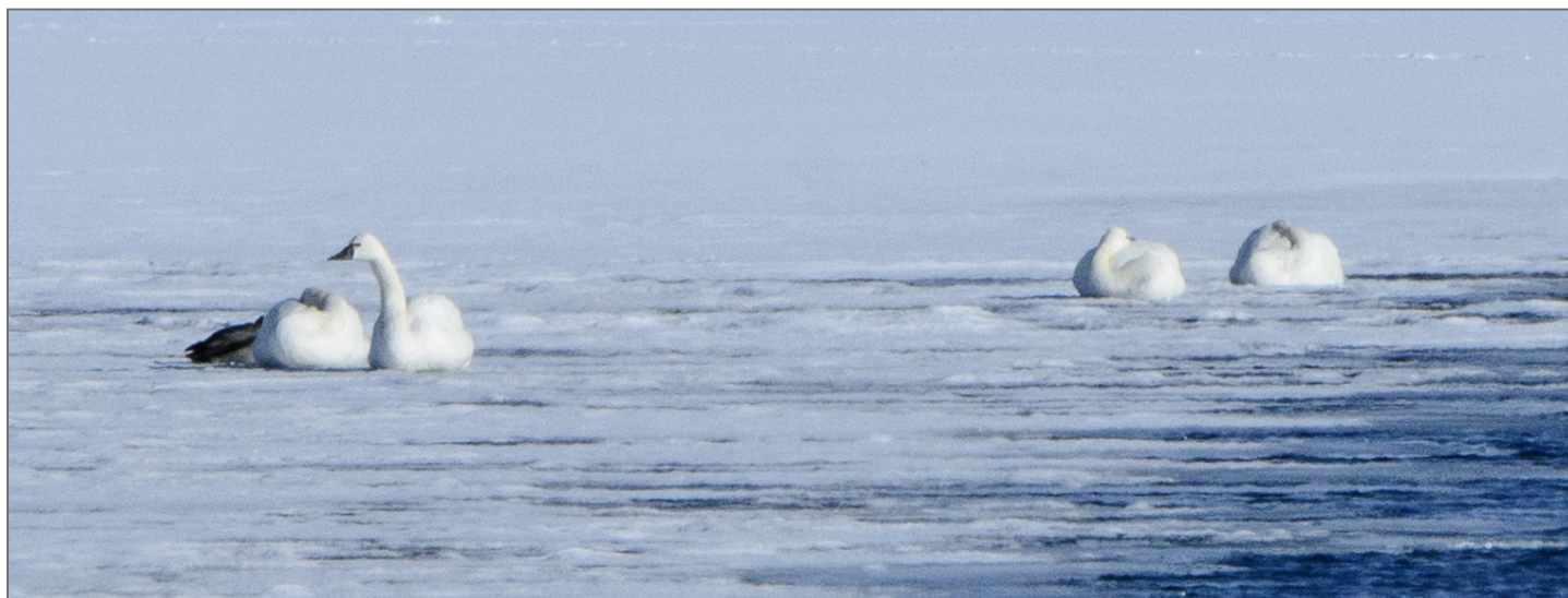
FIGURE 2. Two pairs of Tundra Swans were observed in Meadow Lake Provincial Park during March 2023.

Northern Pygmy-Owl ( Glaucidium gnoma ): this account covers observations made over a period of 16 weeks, from 8 March to 28 June 2023, "near the Cold Lake