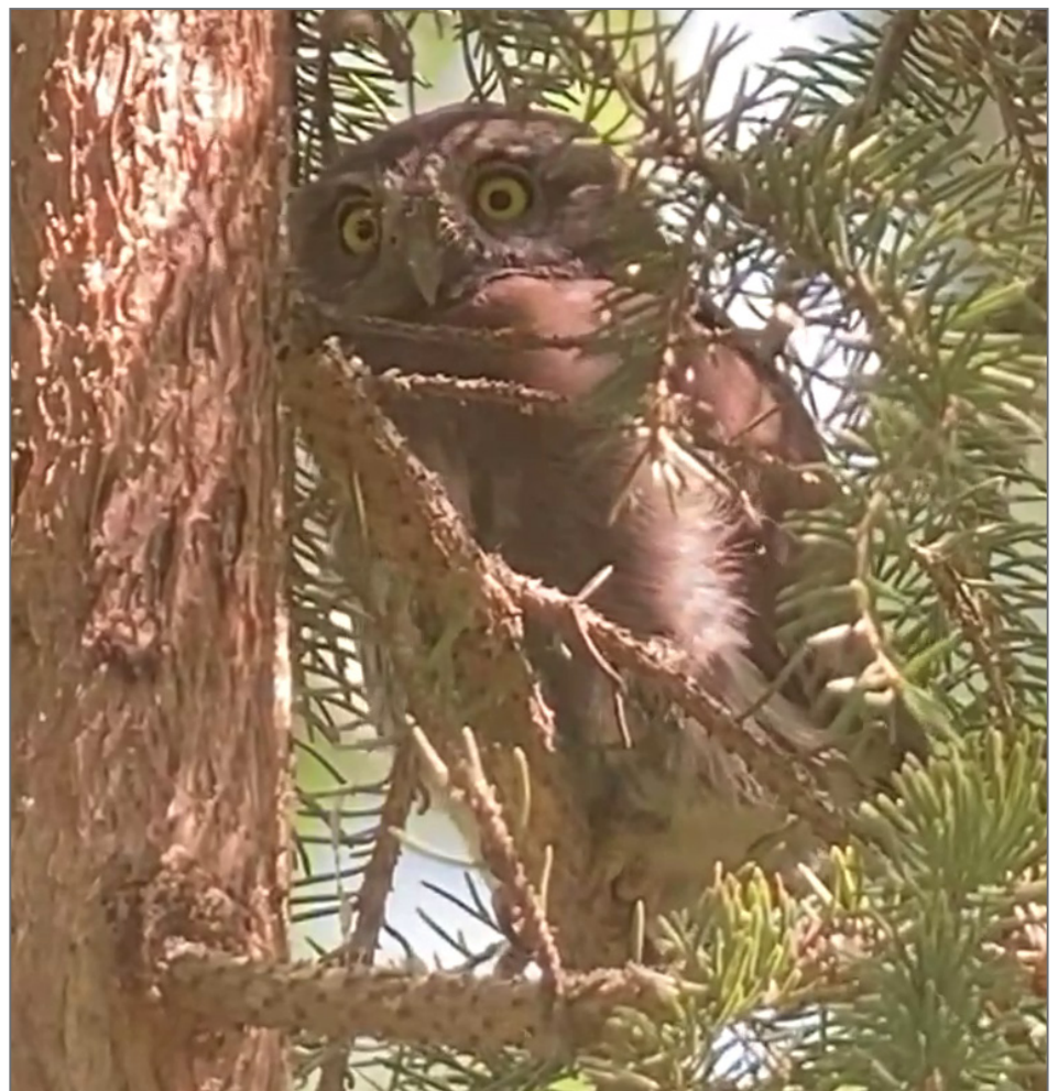
FIGURE 4. A recently fledged juvenile Northern Pygmy-Owl, observed on 23 June 2023 near the trunk of a spruce tree.

The boreal forest habitat in that region of the park is a diverse mosaic of several species of mature evergreens and deciduous trees, which is comparable to Alberta where Northern Pygmy-Owls have "demonstrated a preference for 'older' forest stands for nesting, although it seems to be [more] flexible in its habitat selection in winter. Pygmy-owls nest in cavities, relying on woodpeckers, fungal decay, and insects to provide suitable cavities." 33 Unfortunately, these mature forests are sought after and cut by the lumber industry for their high-quality wood products, which removes prime nesting habitat of pygmy-owls.