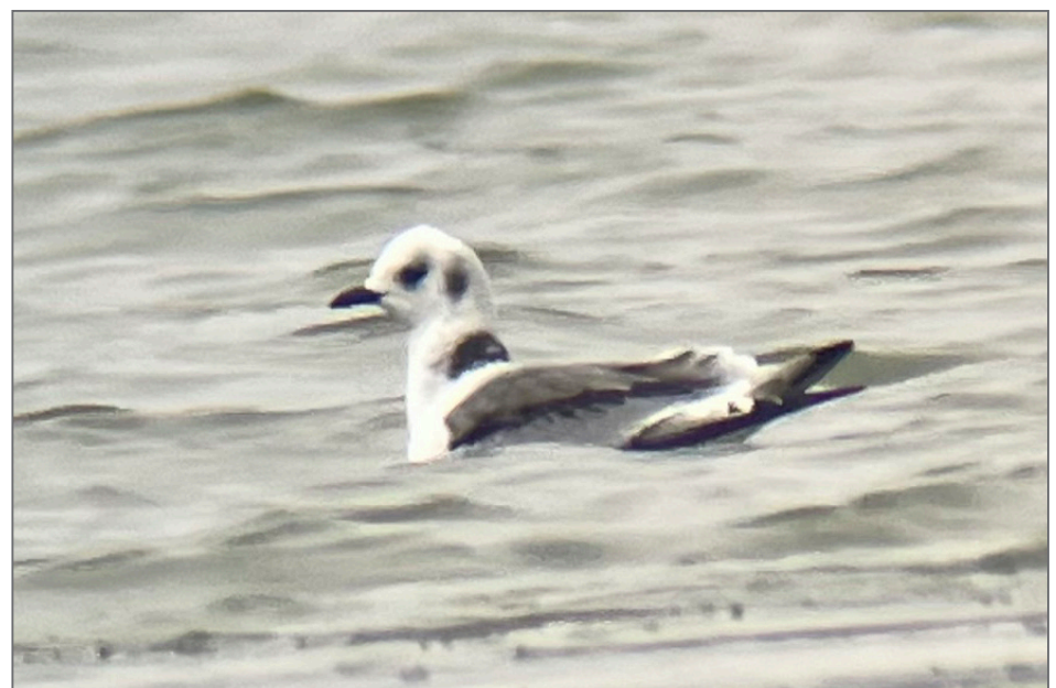
FIGURE 12. A single first winter Black-legged Kittiwake was observed on 5 November 2023 at Crooked Lake.