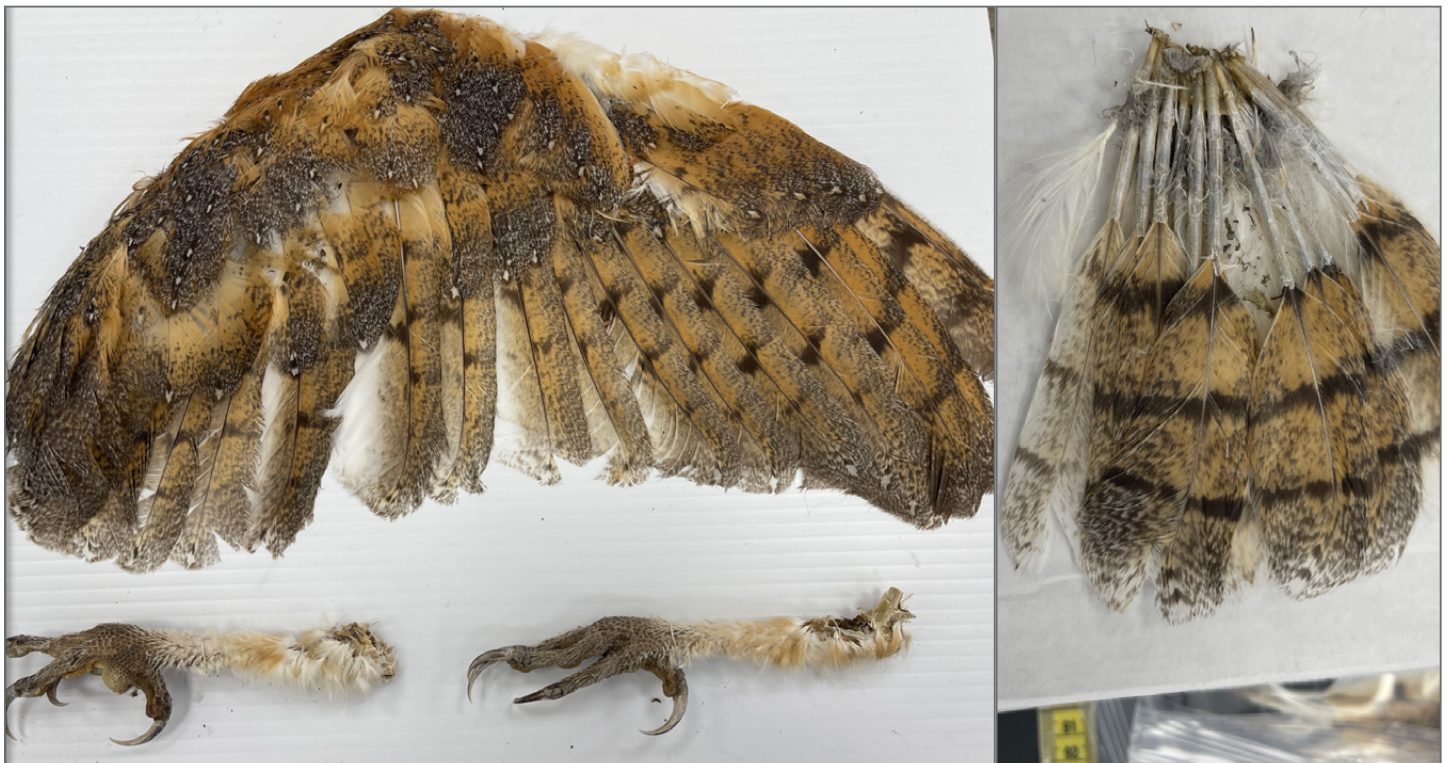
FIGURE 1. A desiccated Barn Owl carcass was discovered on 22 August 2019 below a window of the vacant United Church in Drinkwater. It was determined to be a fledgling, young owl. Pictured here are its right wing and legs (left image) and its tail feathers (right image).

Additional details regarding the story of this wayward hummingbird in Saskatchewan are available in the Blue Jay 3,25 and in Living Sky Wildlife Rehabilitation newsletters from 2023.