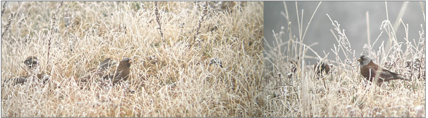
FIGURE 10. A flock of 54 Gray-crowned Rosy-Finch ( Leucosticte tephrocotis ) was photographed on 23 October at Bald Butte, Cypress Hills Interprovincial Park by Jared, Teal, and Rowan Clarke. The flock included both the Interior ( L. t. tephrocotis ), seen in the left side of the image, and the Gray-cheeked or Hepburn's subspecies ( L. t. littoralis ), shown on the right.

occur almost anywhere in the province, but are often seen in and around the Cypress Hills. Most Saskatchewan records are of the interior tephrocotis , which regularly descend onto the plains east of the Rockies in winter, compared to only five previous records of the more sedentary coastal littoralis . The first major Pacific storm system of autumn brought significant snow accumulations from the Rocky Mountains east into southwestern Saskatchewan on 23-24 October, perhaps hurrying the early rosy-finches ahead of its arrival. As the strong El Niño weather pattern of 2023 continued, it brought above-average temperatures to the province in November and December and left many areas with little snow cover, when rosy-finches appeared at several locations across the province.