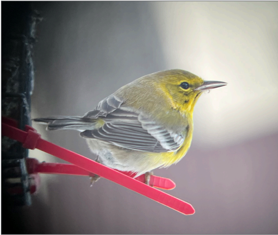
FIGURE 14. A Pine Warbler was observed in Carlyle during December 2023.

Fox Sparrow ( Passerella iliaca ): on 20 April 2023, Don Weidl counted 34 Fox Sparrows (all the ‘Red’ form) in Broadview feeding on the ground in his yard (eBird S134420121). A late spring cold front brought widespread snow across southern Saskatchewan in the third week of April, interrupting the migration of several species. Status: high count for spring migration. Weidl commented this was an “unbelievable number”.