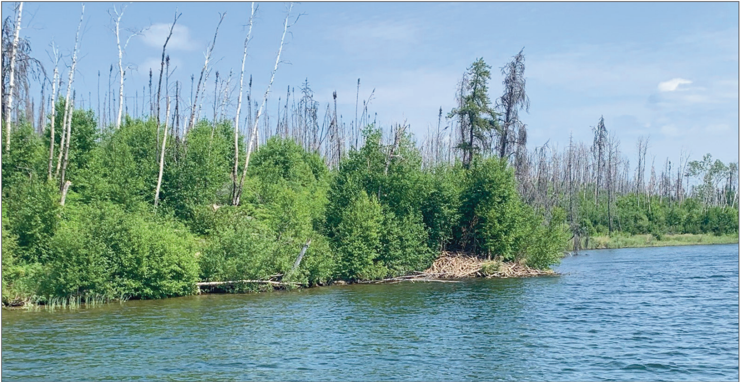
FIGURE 7: An occupied beaver lodge built in 2021 along the shoreline burned in 2015. Note the growth of aspen and alder along the shoreline.

abundance ( \chi^2 = 2.9 , p = 0.089 ). The reason for this is not clear. Perhaps it is because on islands, beavers are less vulnerable to predators like wolves, bears, wolverines and cougars 32-35 or perhaps it is because many of the islands are large and have small bays. Further research is recommended to provide insights on this observed pattern.