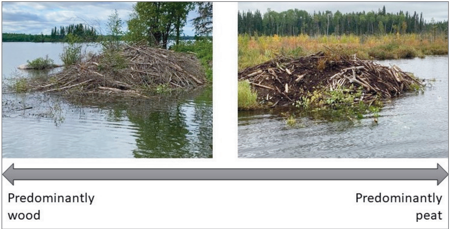
FIGURE 5: Examples of the diversity of construction and composition of beaver lodges on Besnard Lake.

2015 (Figure 7); nine were classified abandoned in 2019. Wildfires renew early successional species like aspen, which is an important beaver food resource. 2 Aspen are quick growing trees; aspen forest stands can reach 10% canopy cover and 5 m average tree height within 5–10 y post fire 28 , but it can take upwards of 20–30 y after a wildfire to renew beaver food resources sufficiently to increase beaver density. 29,30 However, fire disturbance can also support production of aquatic plants, the availability of which is associated with the persistence and density of beaver occupancy in lakes. 31 We will continue to monitor the number of occupied lodges along the burned shoreline to evaluate recovery post-fire.