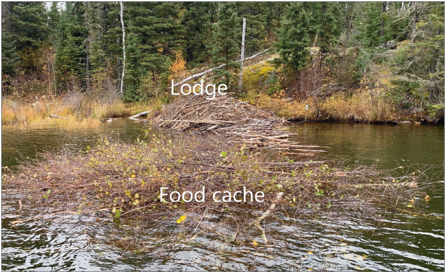
FIGURE 3: Caching of food (woody materials) in a pile close to the entrance of the lodge, as shown here, supplies a beaver family with much of its food during the winter when the lake is frozen; 11 October 2020.

is the most biologically useful measure of beaver density. Lodge occupancy was 50% and occupied lodge density was 0.19 colonies/km of shoreline. Lodge occupancy was lower than that recorded for a lake about half the size of Besnard in Texas (95% occupancy) 15 , but there are only a few reports of lodge occupancy for lakes in the scientific literature. A high ratio of unoccupied to occupied lodges can reflect overharvesting, overpopulation or other environmental constraints. 16 Fluctuating lake levels might make some lodges habitable in drier or wetter years. 14 In lakes where water levels fluctuate greatly year to year a high incidence of two or more lodges within 0.5 km of one another, usually at different heights relative to the high water mark, would be expected; however, we observed few instances of two or more lodges within 0.5 km of each other. It is also unlikely that