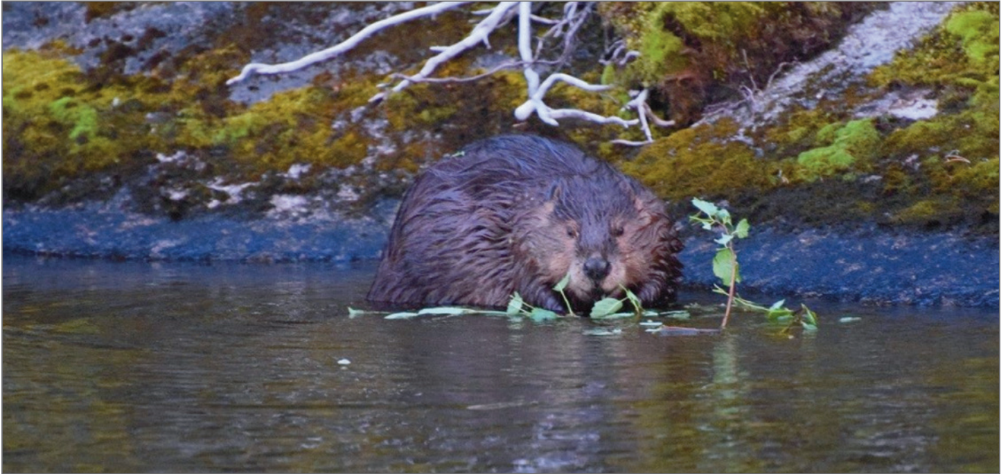
FIGURE 1: A juvenile beaver eating the bark of an alder stem on Besnard Lake, July 2021.