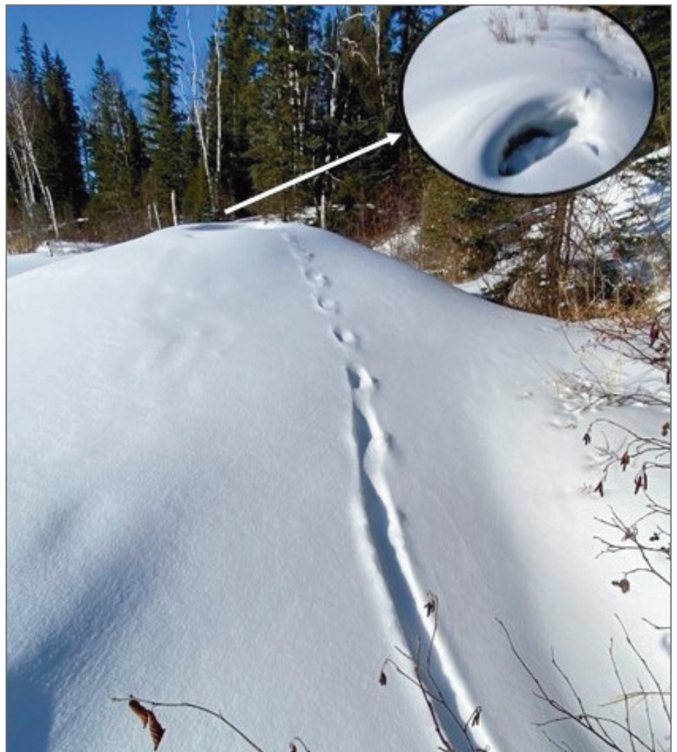
FIGURE 6: Snow covered, occupied beaver lodge with close-up of breathing hole on top (inset) at Besnard Lake, March 2021. This is the same lodge shown in Figure 3.

It might be expected that lodge density would be lower on islands than the mainland at Besnard Lake, as islands burn less often and thus have mostly coniferous forests. However, this was not the case. While we did observe more occupied beaver lodges on the mainland (83) than on islands (17), the shorelines were used in proportion to their