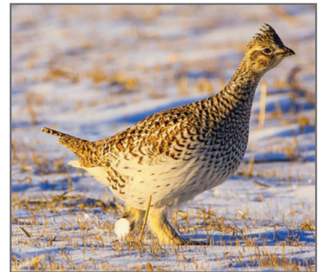
Sharp-tailed Grouse.