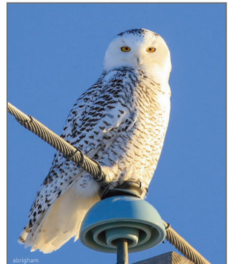
Snowy Owl.