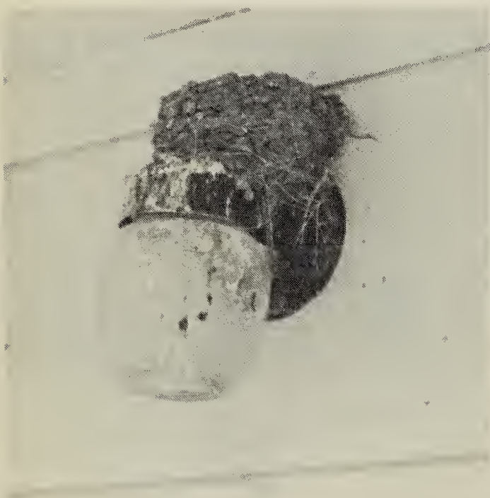
Figure 1. Barn Swallow nest.

For the next two summers the birds tried to get into the shed whenever I opened the door; however, I won out. They built on a light fixture adjacent to the small door of the shed (Fig. 1). Then this August, after I had been away for a few days, whenever I opened the door, I had the impression of something flying out. Several days passed before I was sure; then I took a belated look up at the rafters. The nest had been completed and a bird was peering over the lip of it.