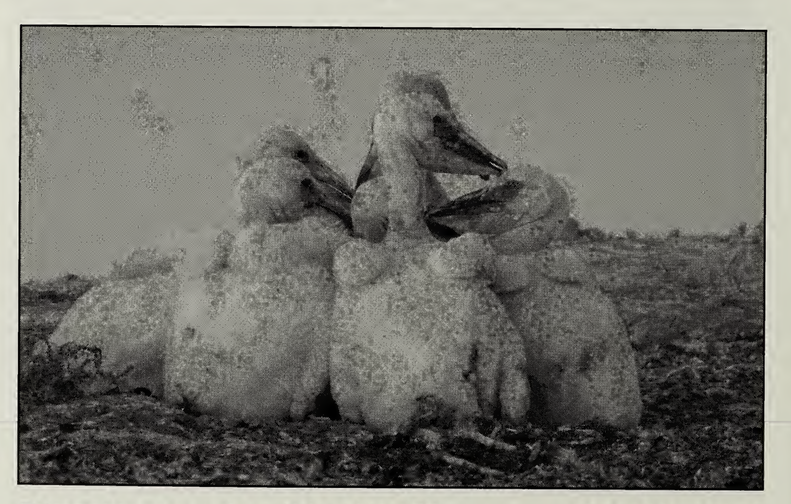
Pelican chicks in a crèche on Pelican Lake, SK.