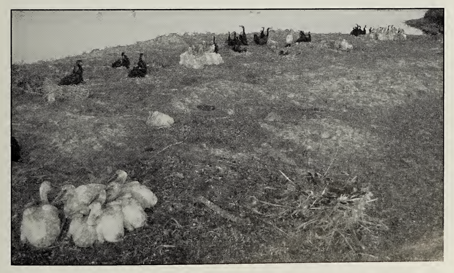
Young pelicans and cormorants on an island in Pelican Lake, SK

Somers CM, Kjoss VA, Leighton FA, Fransden D (2010) American White Pelicans and Double-crested Cormorants in Saskatchewan: population trends over five decades. Blue Jay 68(2):75-86.