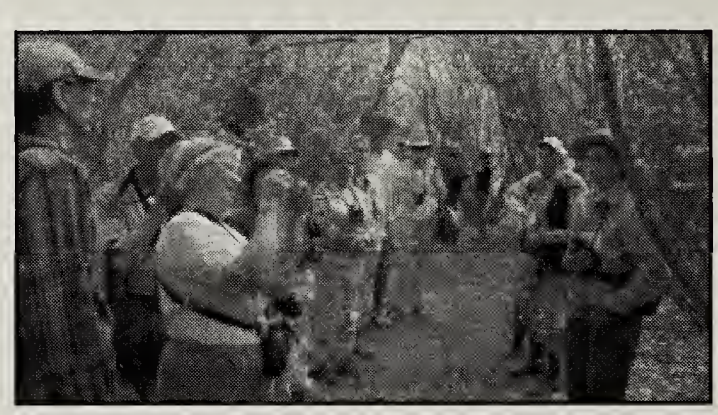
60th anniversary of Nature Saskatchewan: mist-netting at the Last Mountain Bird Observatory.