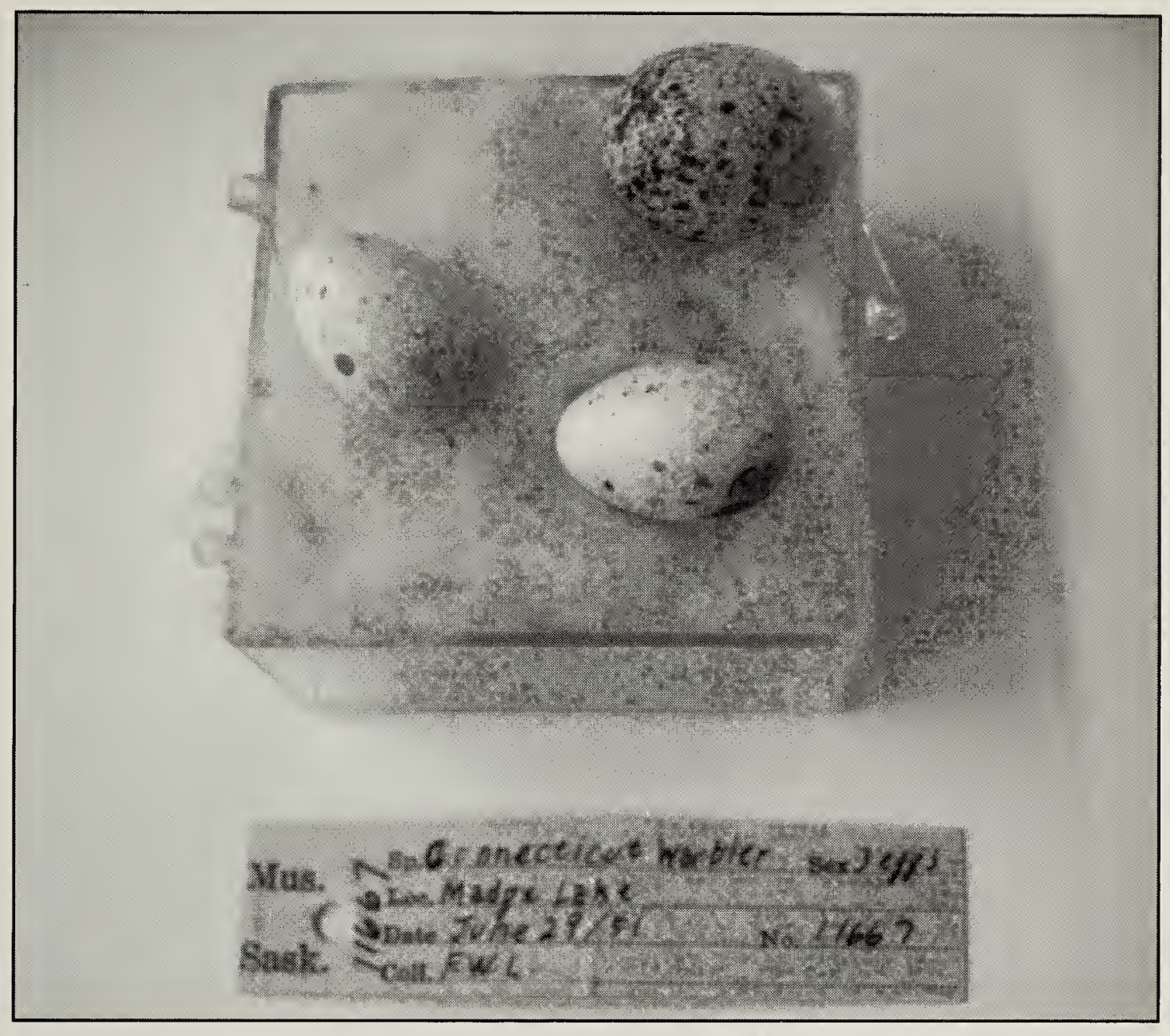
Figure 1. A putative Connecticut Warbler clutch (RSM #11667) with a cowbird egg collected 29 June 1951 by Fred W. Lahrman at Madge Lake, SK.