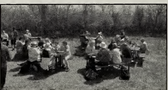
Lunch at the Last Mountain Regional Park between field trips