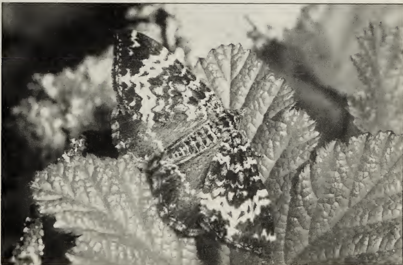
Figure 1. Spear Mark at Patterson Lake, SK

Broken-banded Carpet Xanthorhoe iduata (Guenée) - Preeceville (24 mm) (June 23).