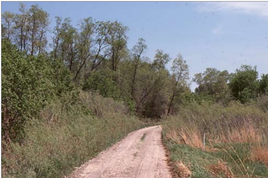
FIGURE 2. The road along the southern edge of the dune-ridge forest, Delta Marsh, on which dead shrews were found. To the north of the road (on the left) are Manitoba Maple ( Acer negundo ), Green Ash ( Fraxinus pennsylvanica ), Peach-leaved Willow ( Salix amygdaloides ), with Sandbar Willow ( S. interior ) along the edge, whereas along the south edge of the road are predominantly sedges ( Carex spp.), Common Reed ( Phragmites communis ), and Sandbar Willow.