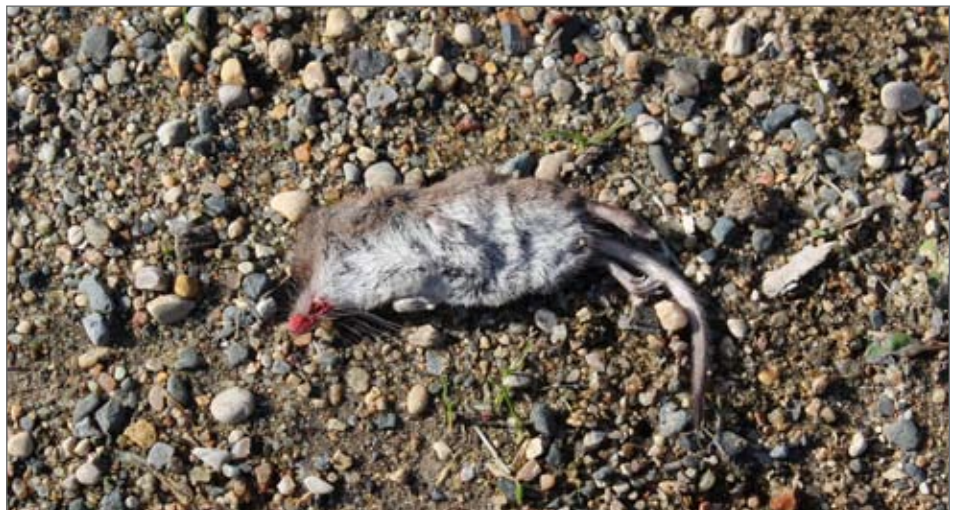
Dead shrew on the road.

I opportunistically collected all but one of the shrews from ~9 km of road that runs from Cram Creek to the hamlet of Delta, east of the Delta Marsh Field Station (University of Manitoba) and Assiniboine River Diversion (Figure 1), through the forested dune ridge that separates Delta Marsh from Lake Manitoba (50°11' N, 98°19' W), in the Aspen-Oak biotic zone. The south edge of the road was bordered by vegetation of Delta Marsh, whereas the northern edge abutted the upland vegetation of the dune-ridge forest (Figure 2). 15,16 An exception was a 1.2-km portion of the road that passed through the marsh. The shrews were collected between late May and early July, usually hundreds of metres apart. An additional specimen of North American Water Shrew ( Sorex palustris ) was collected from a road that transected a stand of White Cedar ( Thuja occidentalis ) at Birch Point (49°10'4" N, 95°14'4" W), Lake of the Woods, Manitoba 17,18 , on July 1, 2001. 16 Common and scientific names of mammals follow Naughton. 6