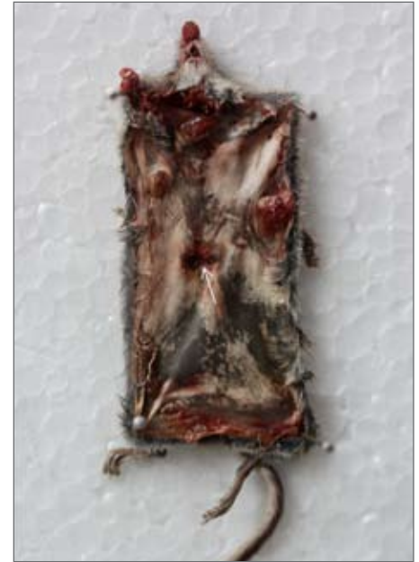
FIGURE 3. Bite marks on the underside of the skin in the thoracic region of a Cinereus Shrew ( Sorex cinereus ). The arrow points to the mid-point between the punctures apparently inflicted by upper canines of a weasel, 5.4 mm apart. The shrew also was bitten on the rostrum.

The width of the space between puncture wounds on the shrews' skin, likely made by upper canines (Figure 3), was measured (one wound per individual) with calipers