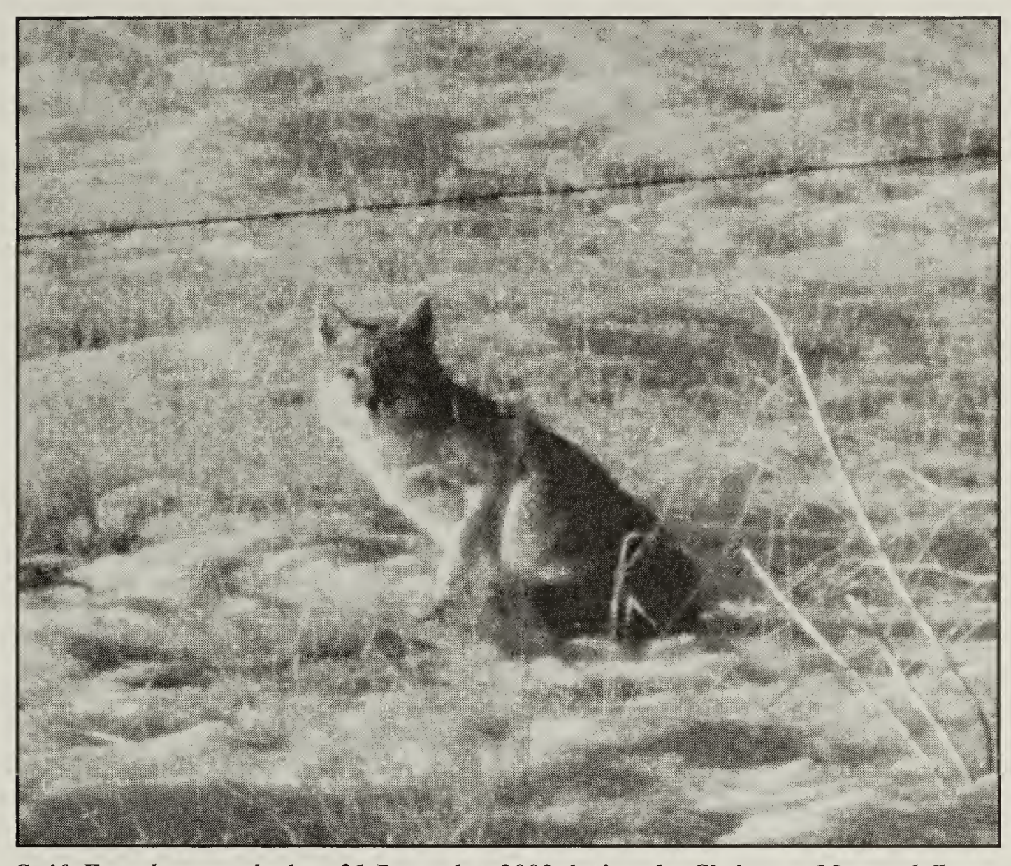
Swift Fox photographed on 21 December 2003 during the Christmas Mammal Count at Govenlock. Val Harris