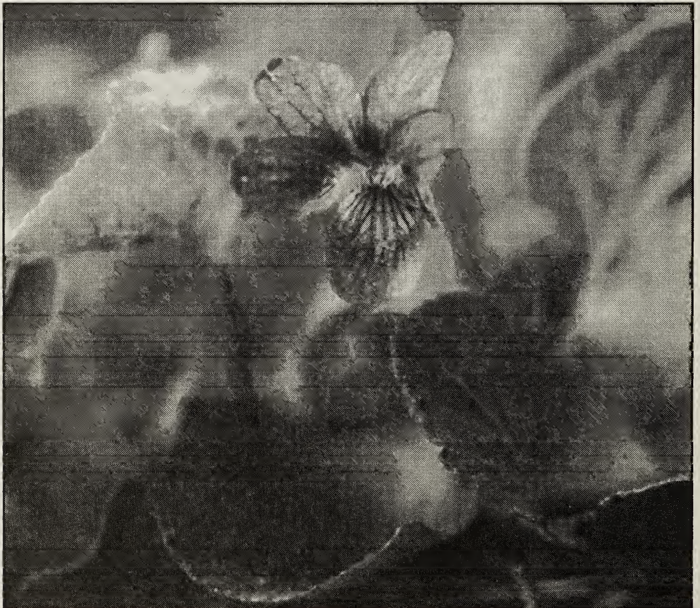
Early Blue Violet

- Zannichellia palustris L. — HORNED-PONDWEED.