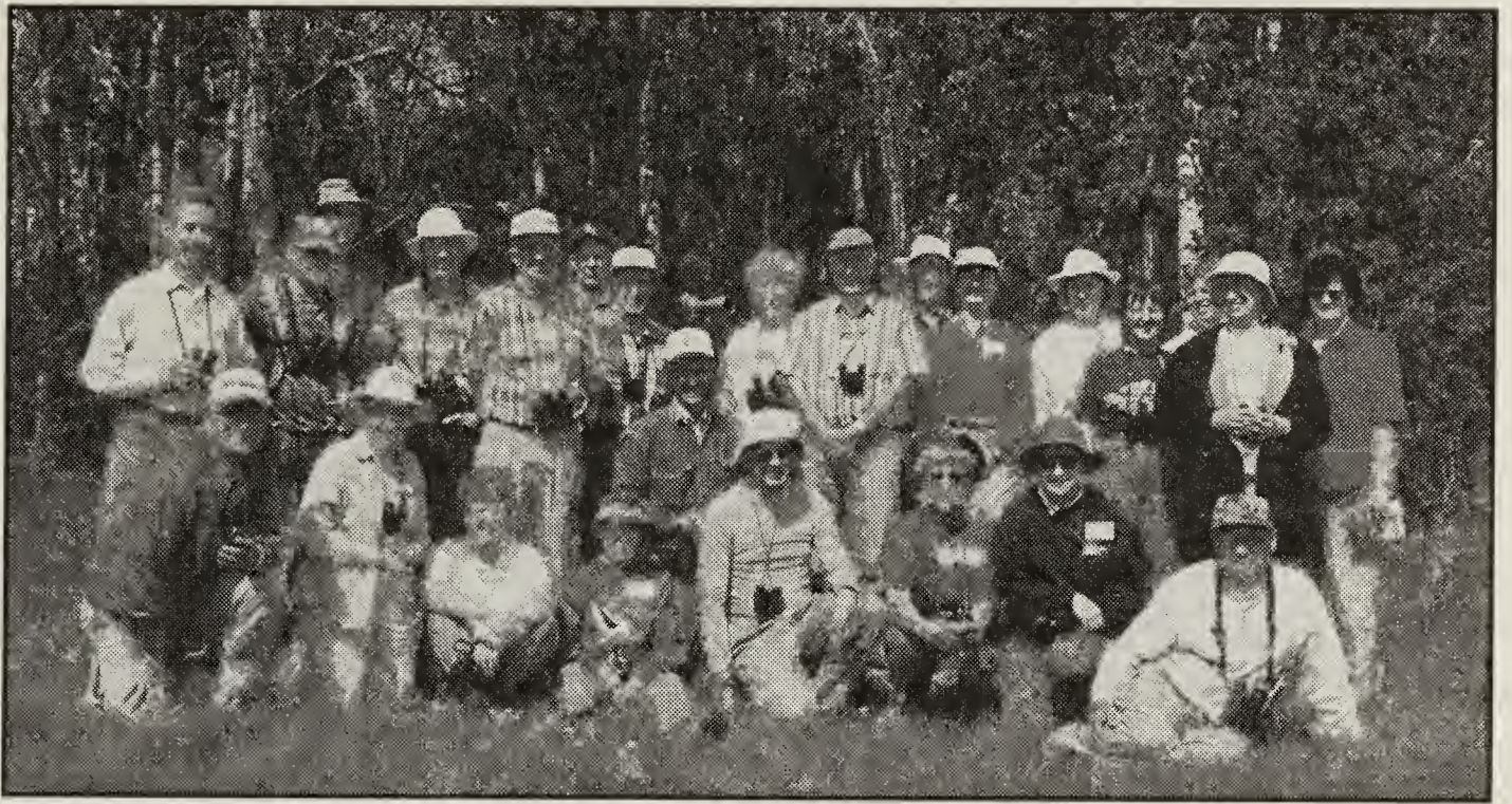
Field trip participants.