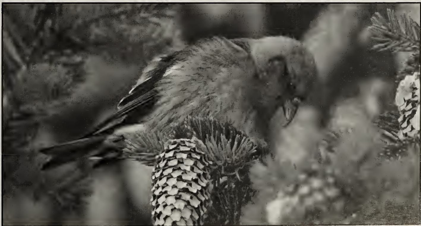
White-winged Crossbill seen in Elbow during the Christmas Bird Count in December 2008.