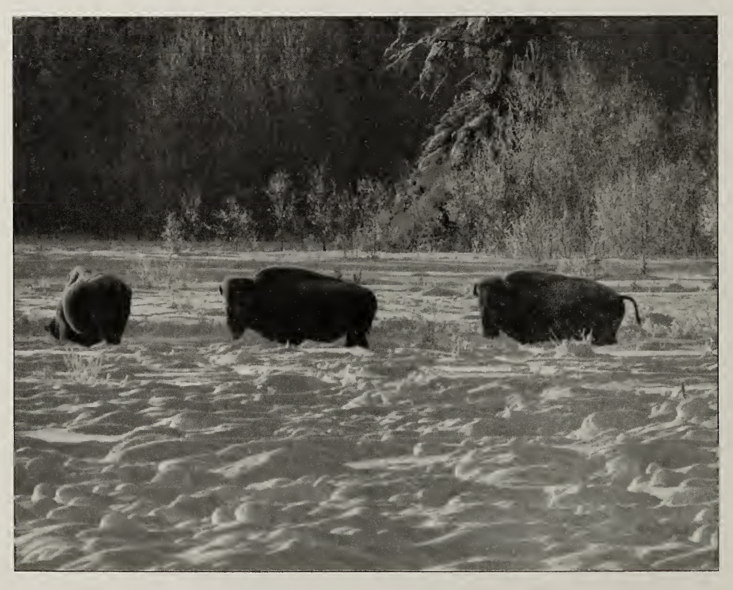
Bison photographed on the Mayview CMC on December 23, 2007.

For species only detected by tracks or by other means, or that are seen or heard only in the count period but not on count day, no numbers of individuals is given in Table 1. Species detected only by tracks are indicated by 't' in the table; those detected only by other means (dead animals 'm', clearly identifiable chewing or digging 'd', dens or lodges 'L' and by smell 's.' Species detected by any means during the count period, but not on count day are indicated by 'c' in the table. These additional species are tallied in lines 3, 4 and 5 at the bottom of the table. If a mammal is reported as a member of a species group (i.e. mouse species, deer species), it is counted as a species only if no other species in this group has been definitely recorded. The columns at the end of the table give totals for each species.