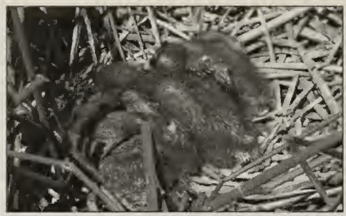
Figure 2. White-faced Ibis nest at Quill Lake, SK Gerry Beyersbergen