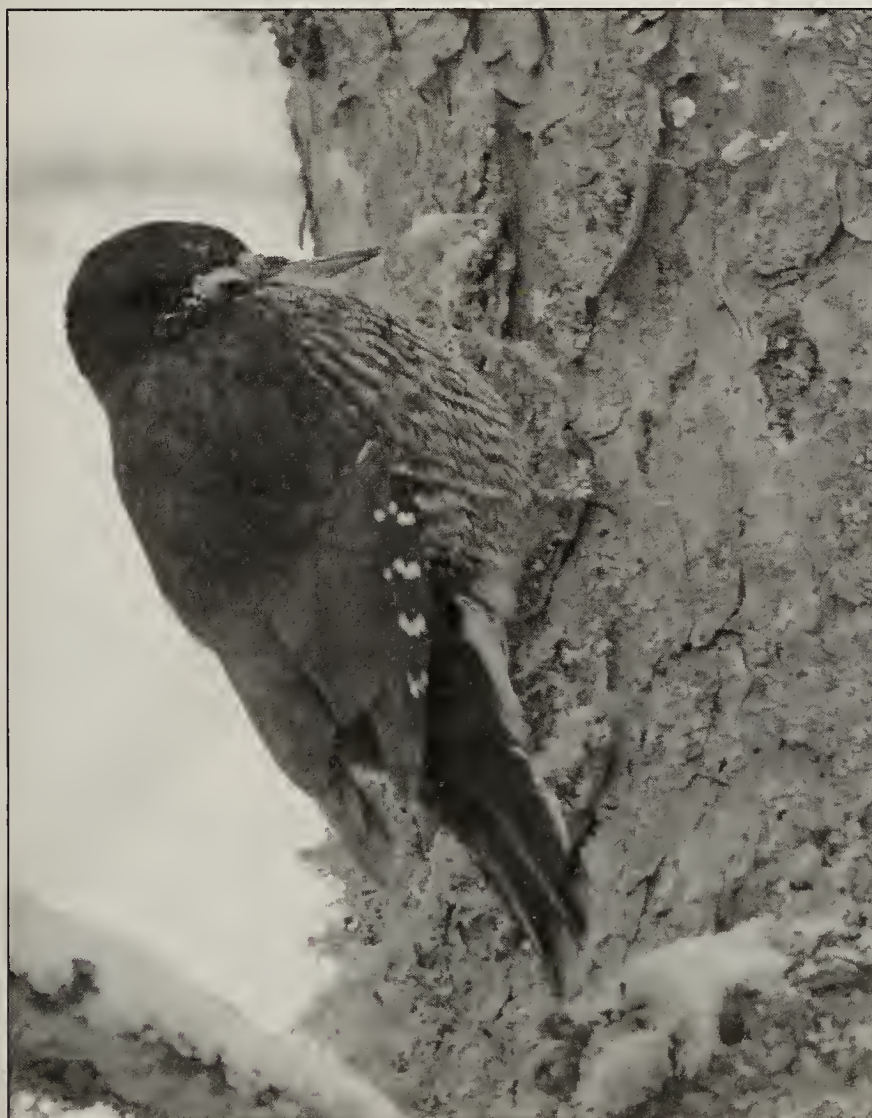
Black-backed Woodpecker photographed on the Squaw Rapids CBC, January 1, 2008. Nick Saunders