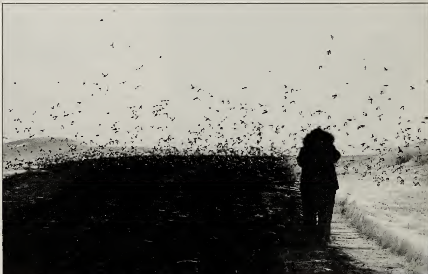
Kelly Peacock photographing Snow Buntings southwest of Reed Lake, SK in January 2008. Randy McCulloch