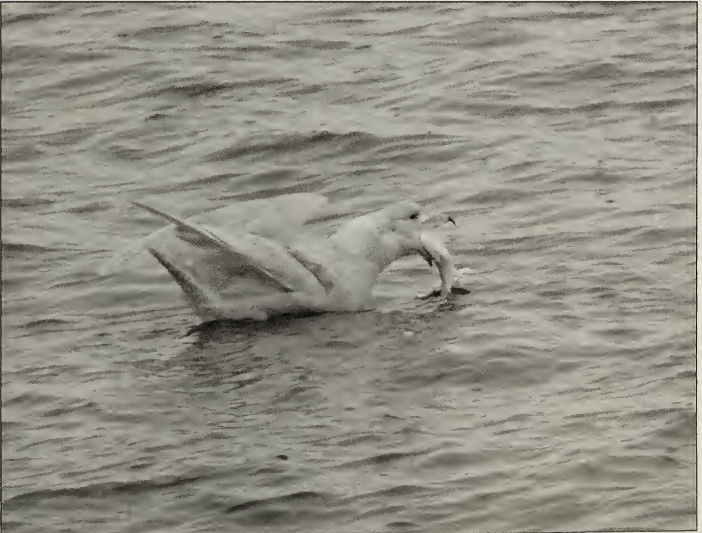
Glaucous Gull swallowing fish, photographed on the Gardiner Dam CBC, December 17, 2007.