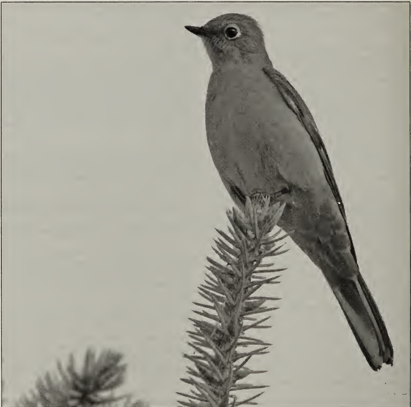
Townsend's Solitaire at Lakeview Park in Saskatoon on November 8, 2007.