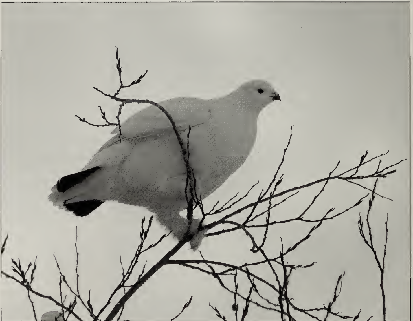
Willow Ptarmigan on the Creighton count