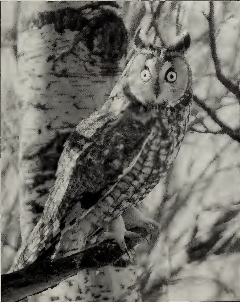
Long-eared Owl photographed on the Morse count, 2 January 2007