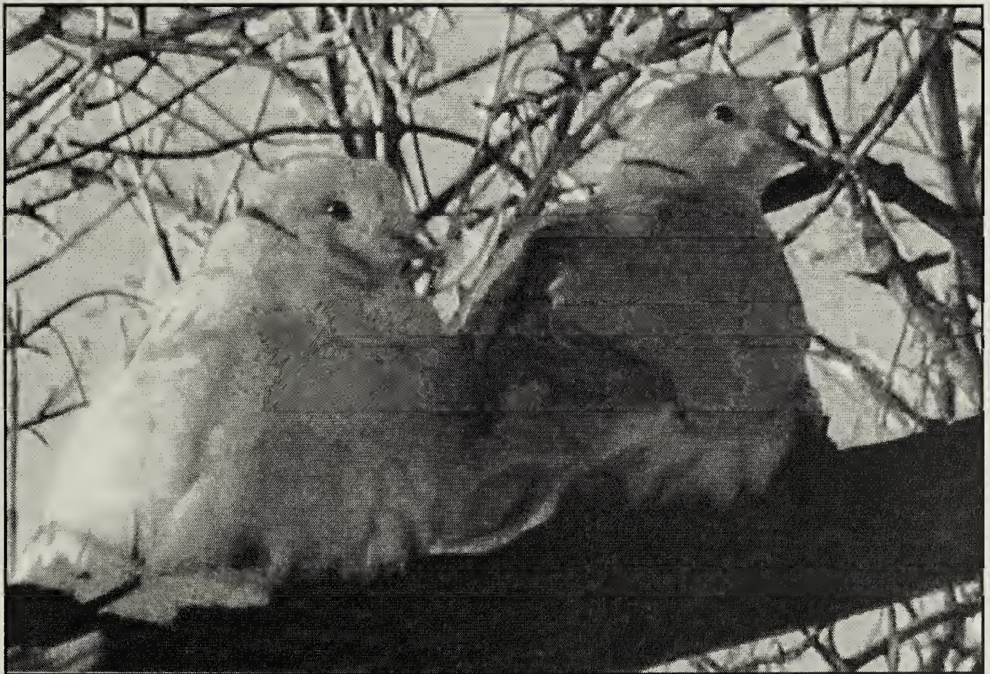
Two of the Eurasian Collared-Doves seen on the Weyburn count