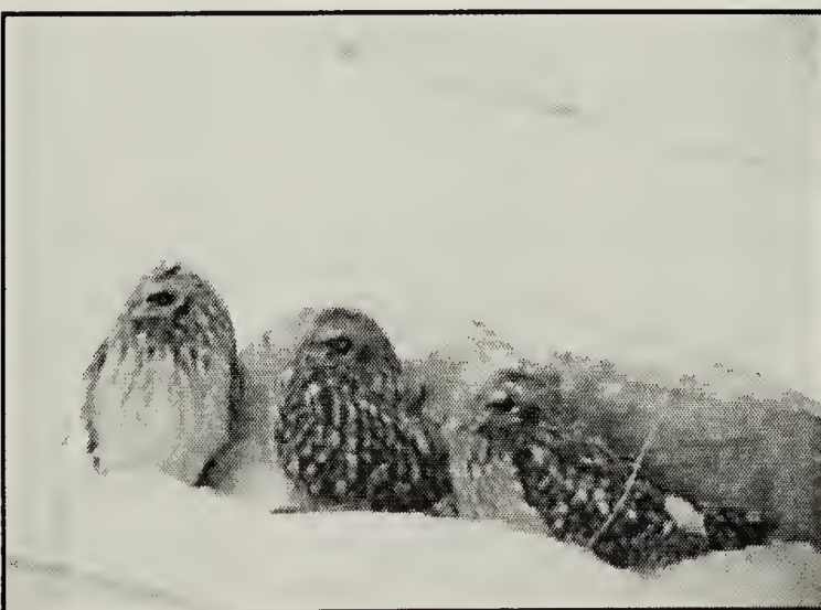
Three Short-eared Owls that are sitting by the rock on the right side of the group picture above.