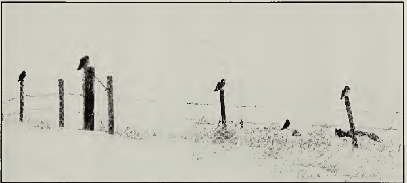
January 8, 2005, 9 miles north and 4 miles west of Kyle. There are eight Short-eared Owls in the picture and there were seventeen owls at this site that day.