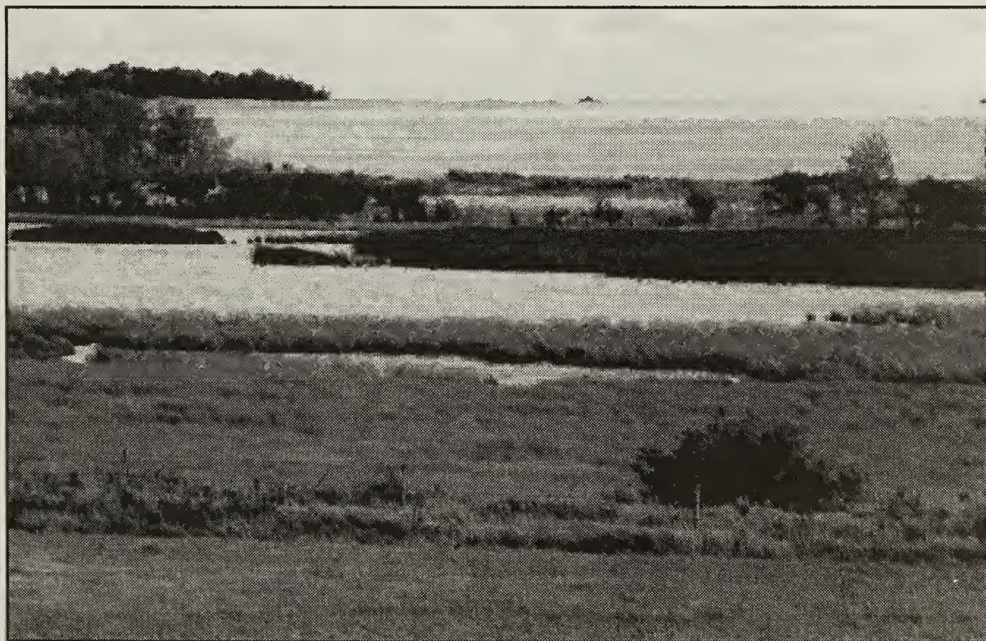
Richmond Lake, SK, summer 2000

of the swans. The swans had fled, but one of the gulls was again located with binoculars. It spiralled downward over a large alkali flat laid bare by seasonal drought, and gently landed on a dry tussock of Alkali Grass ( Puccinellia nuttalliana ) approximately 100 m offshore. After standing, then turning several times, it settled, much to my amazement, onto a nest. It was not possible to determine the number of eggs because of the distance from the nest. Other tussocks were scanned for signs of nests, but none was found, nor were any other Bonaparte's Gulls seen in that immediate area. On returning to the vehicle, I again noted the other adult actively feeding over