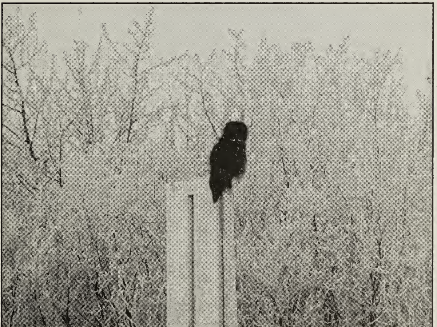
Great Gray Owl