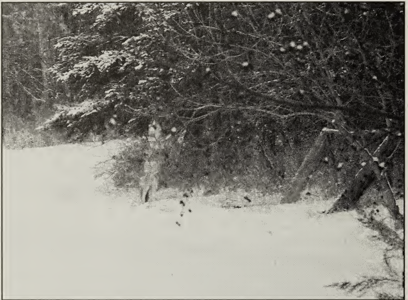
Coyote eating Crab Apples at Crooked River