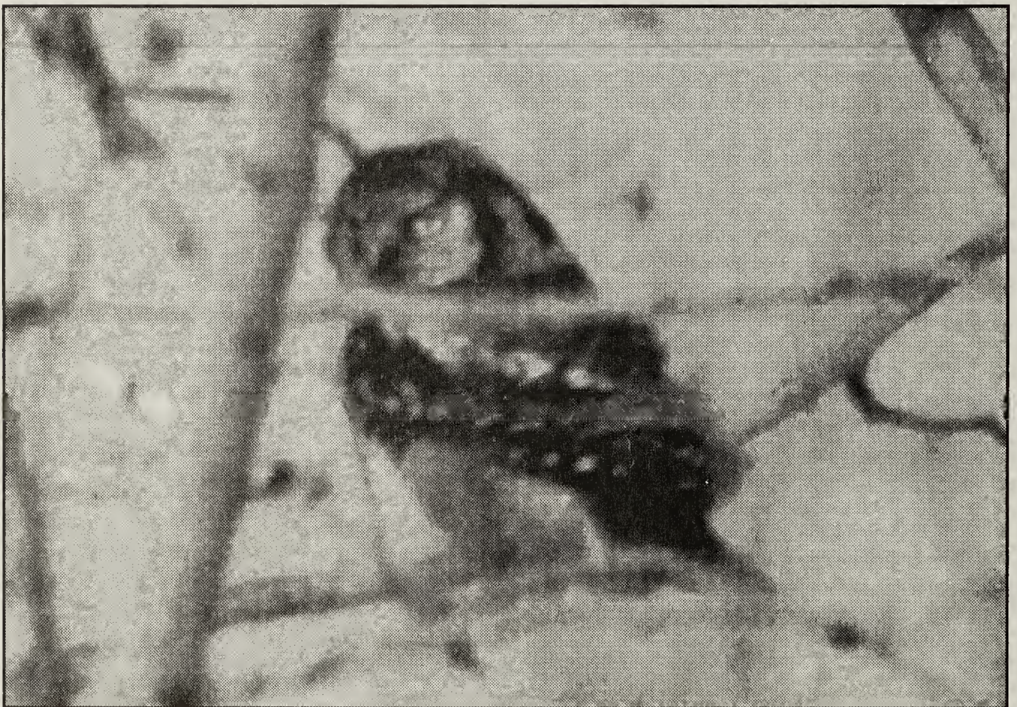
Northern Hawk-Owl, Moose Jaw, December 26, 1999