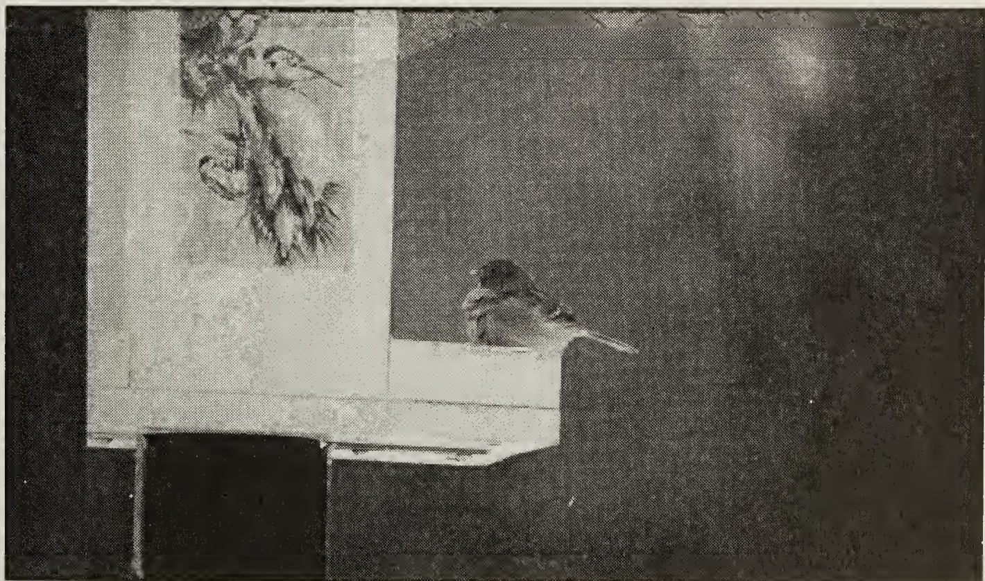
Field Sparrow at feeder - Birch Hills