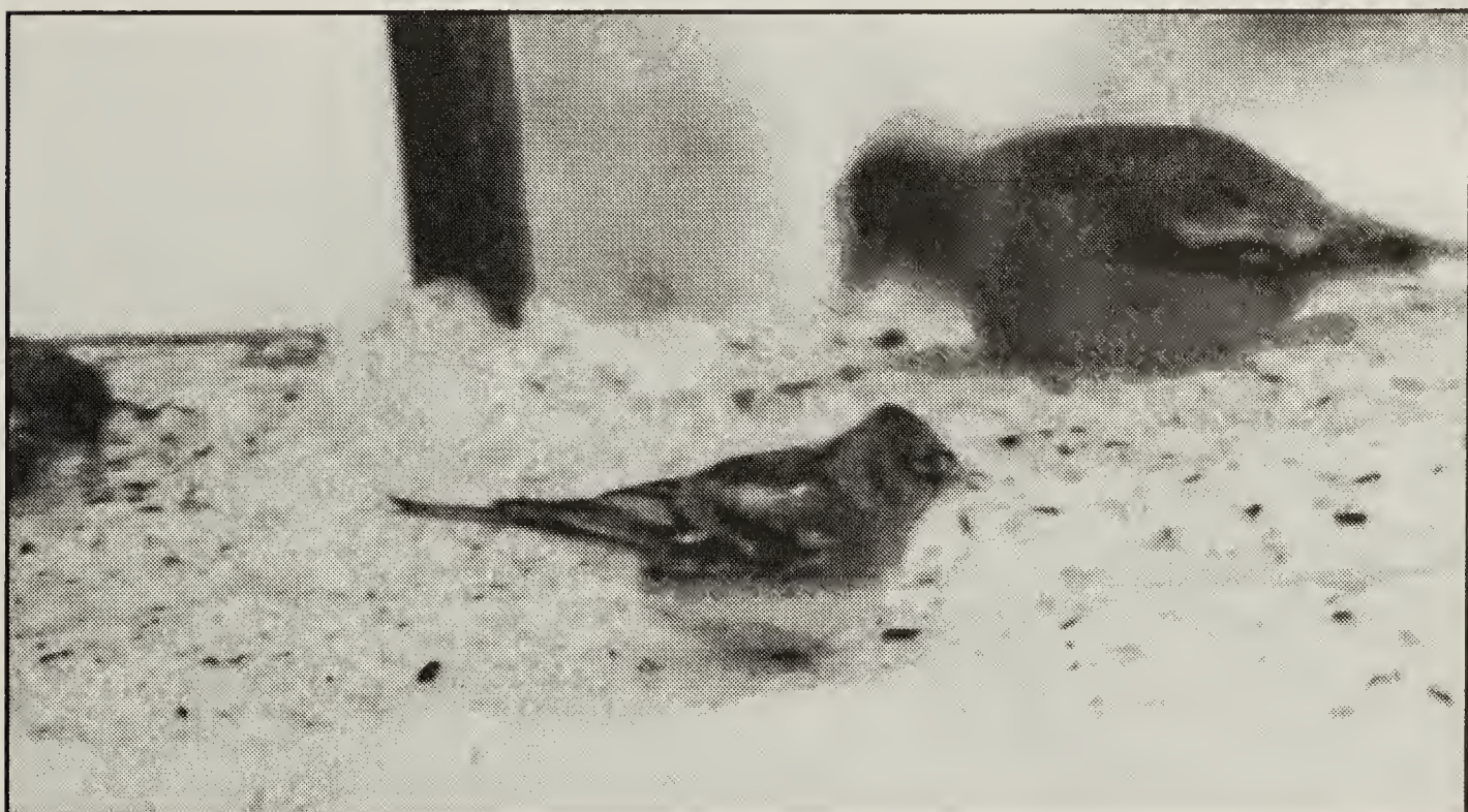
Brambling at Macdowall