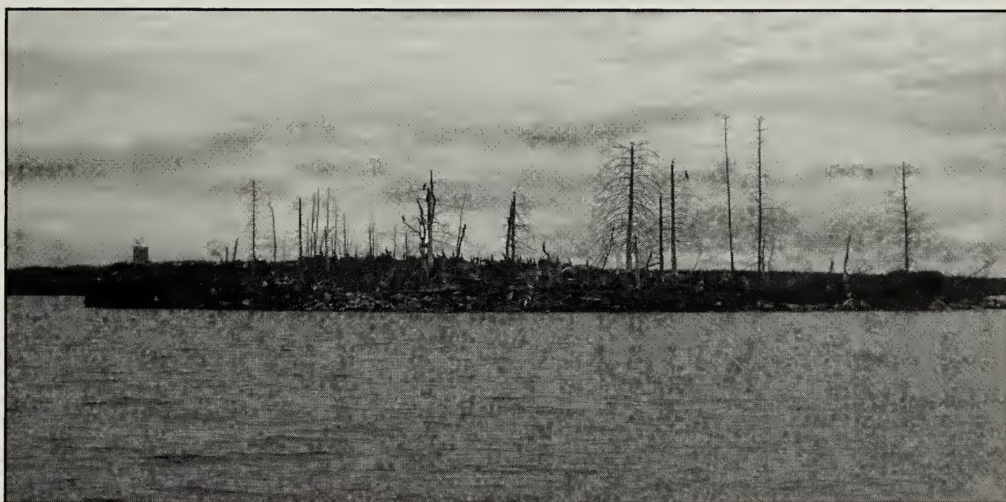
Figure 2. Double-crested Cormorant colony in Nut Bay, Lac La Ronge, SK, is the first documented cormorant colony on Lac La Ronge. Jennifer L. Doucette

Populations of Double-crested Cormorants are recovering throughout North America after a major decline in productivity in the late 19 th and early 20 th centuries likely due to human persecution and pesticide contamination (e.g., DDT). 1,2