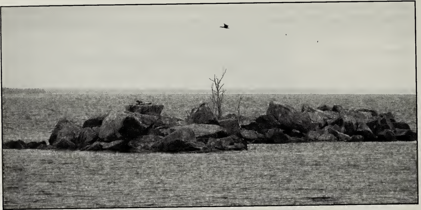
Figure 3. Double-crested Cormorant colony with 50 nests located east of Long Island, Lac La Ronge, SK. The La Ronge cormorant colonies are the first known colonies in the Boreal Shield region of Saskatchewan. Aleksandra Bugajski

Little is known about cormorant breeding colonies in Saskatchewan before this time, so it is unclear whether cormorant colonies have ever previously existed on the Boreal Shield. The low productivity of northern lakes typically does not support large numbers of avian predators, and no previous records of cormorants breeding on Lac La Ronge exist. The cause of what is likely a recent northern range expansion for these birds is unknown, but it will be important to understand how these novel predators fit into Boreal Shield lake ecosystems.