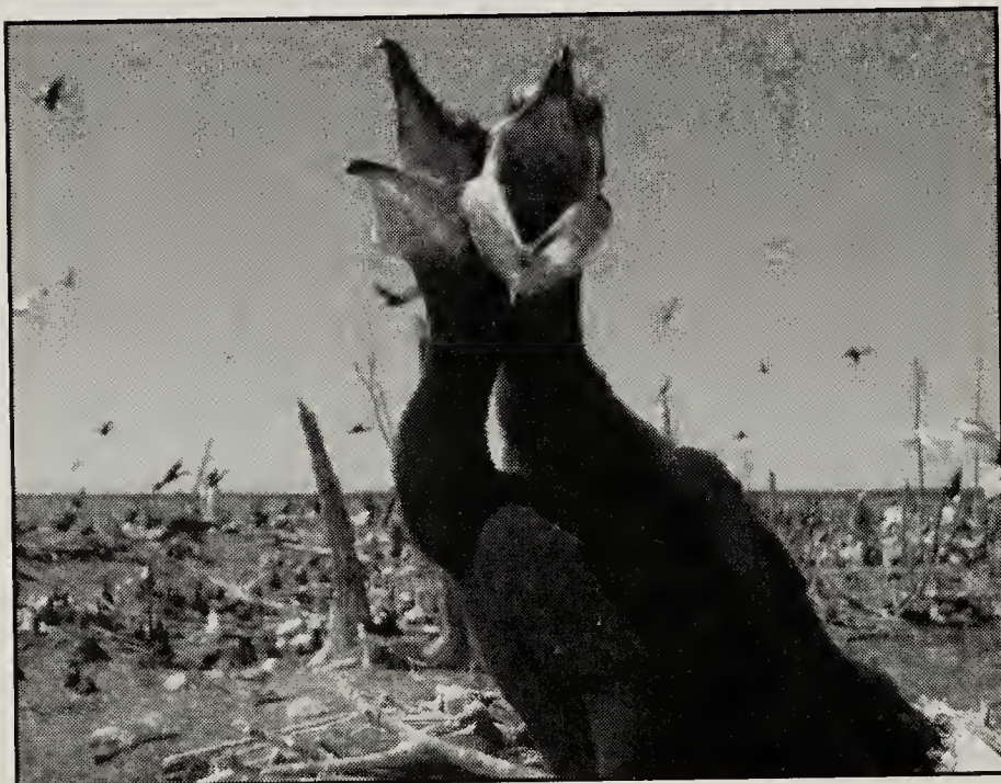
Figure 4. Unfluffed juvenile Double-crested Cormorants. Jennifer L. Doucette