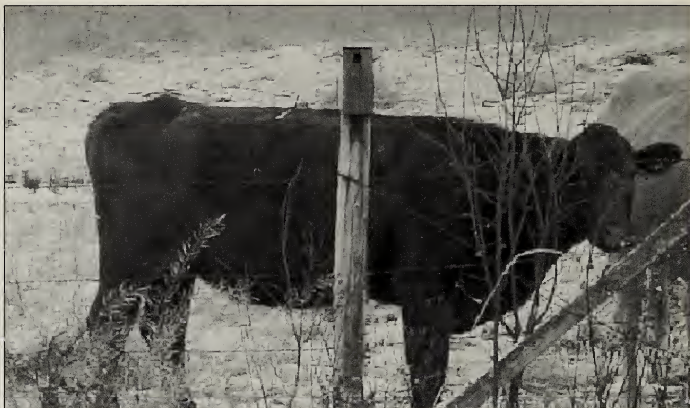
Figure 3. Cattle Egret on the back of a cow, 18 October 2006