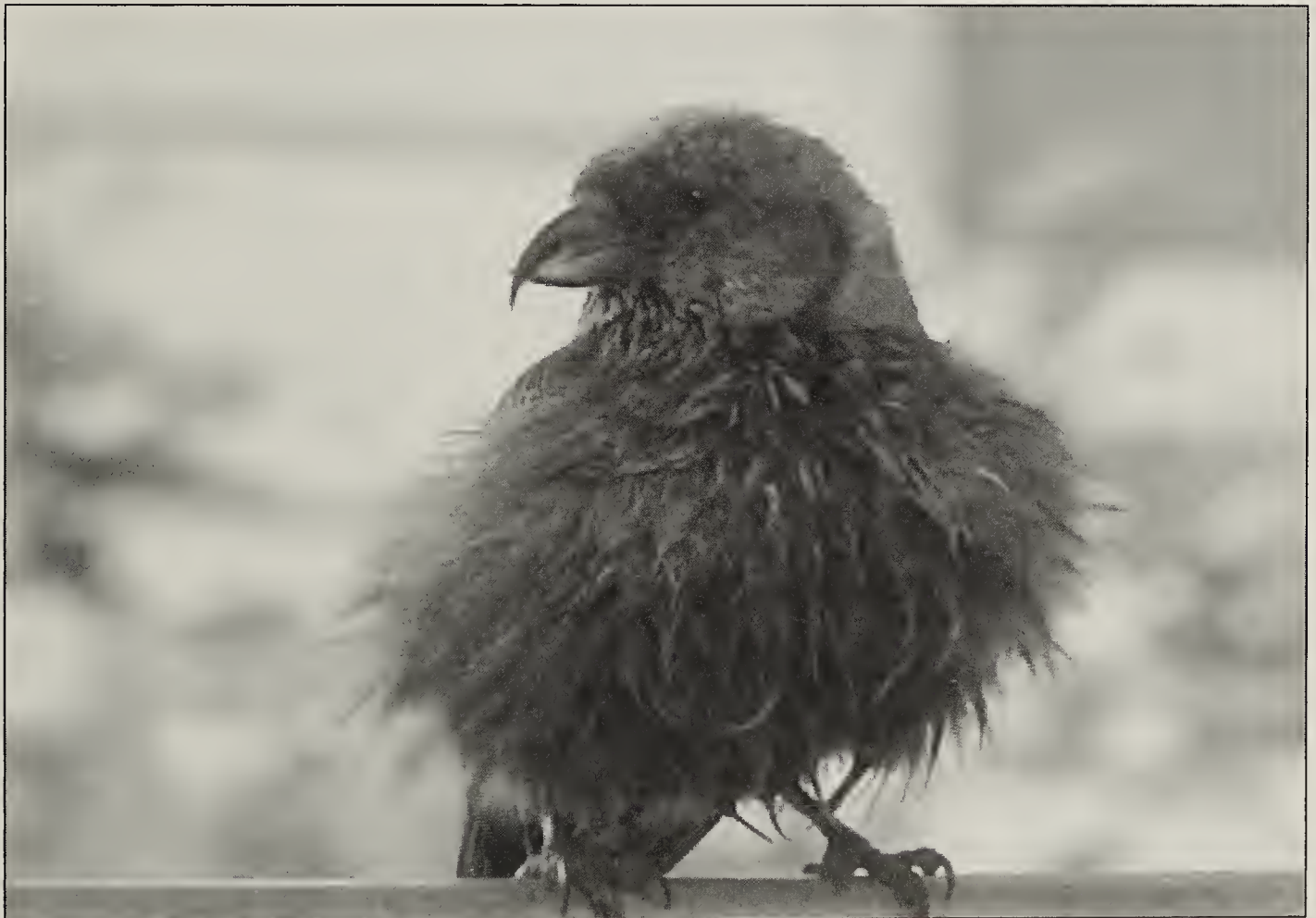
White-winged Crossbill after a bath in a water fountain in Swift Current.