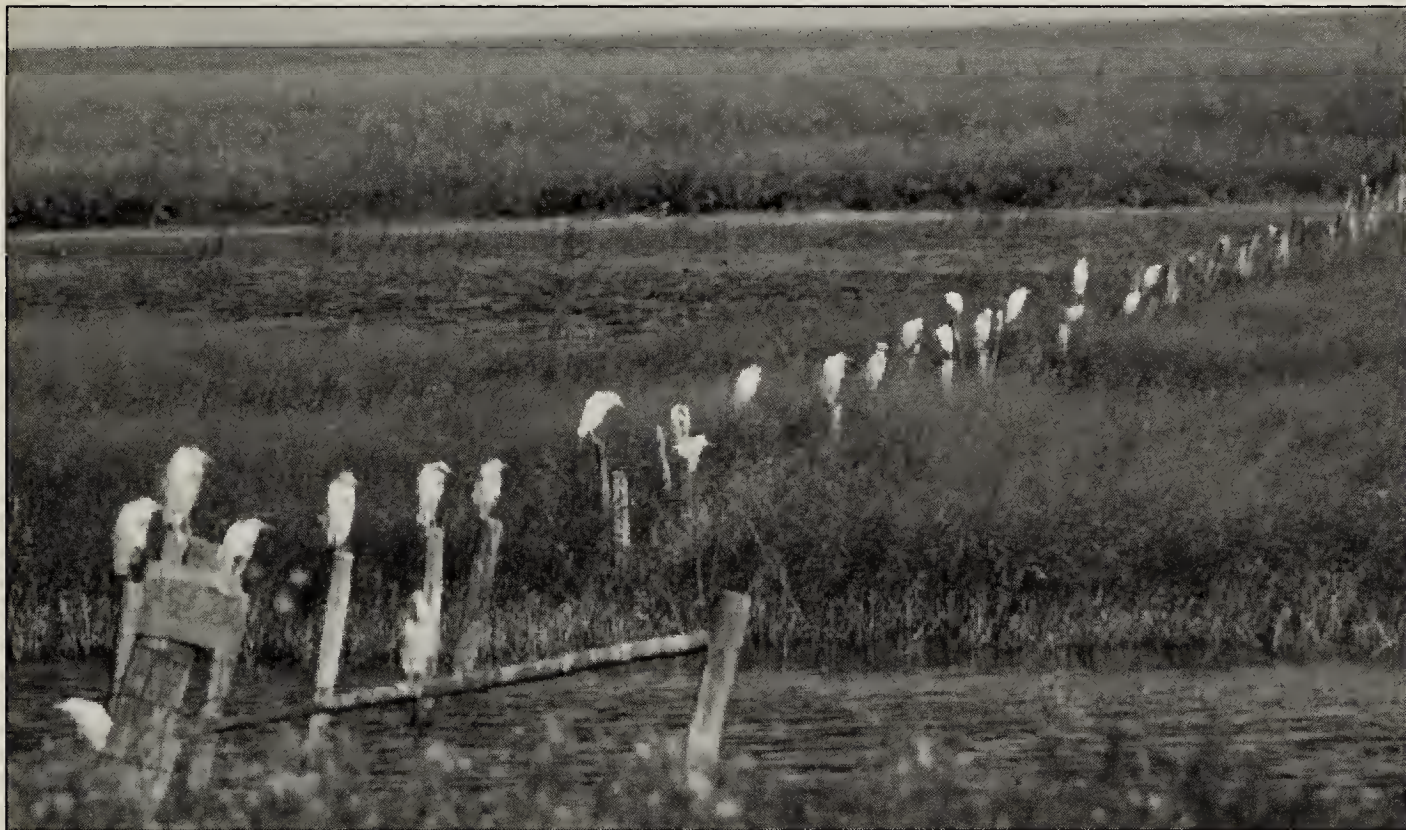
Figure 1. Cattle Egrets at the Borsheim project beside Highway 15 on 27 August 2006