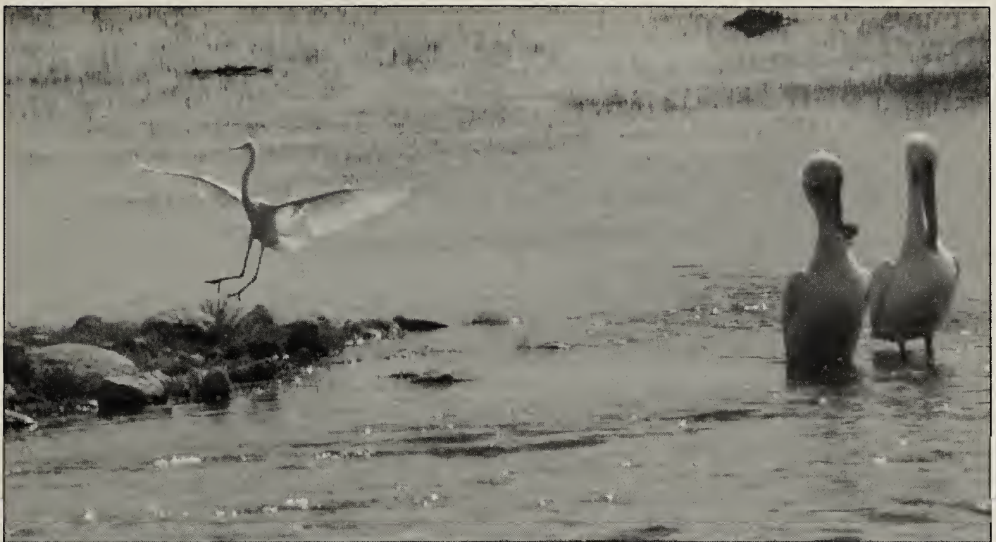
Figure 2. Great Egret and American White Pelicans, 14 May, 2006 V. Kjoss

intriguing as no nest was found. There are only two breeding records for Saskatchewan: east of Craven in the Qu'Appelle Valley in 1955 and Middle Quill Lakes in 1976. 23