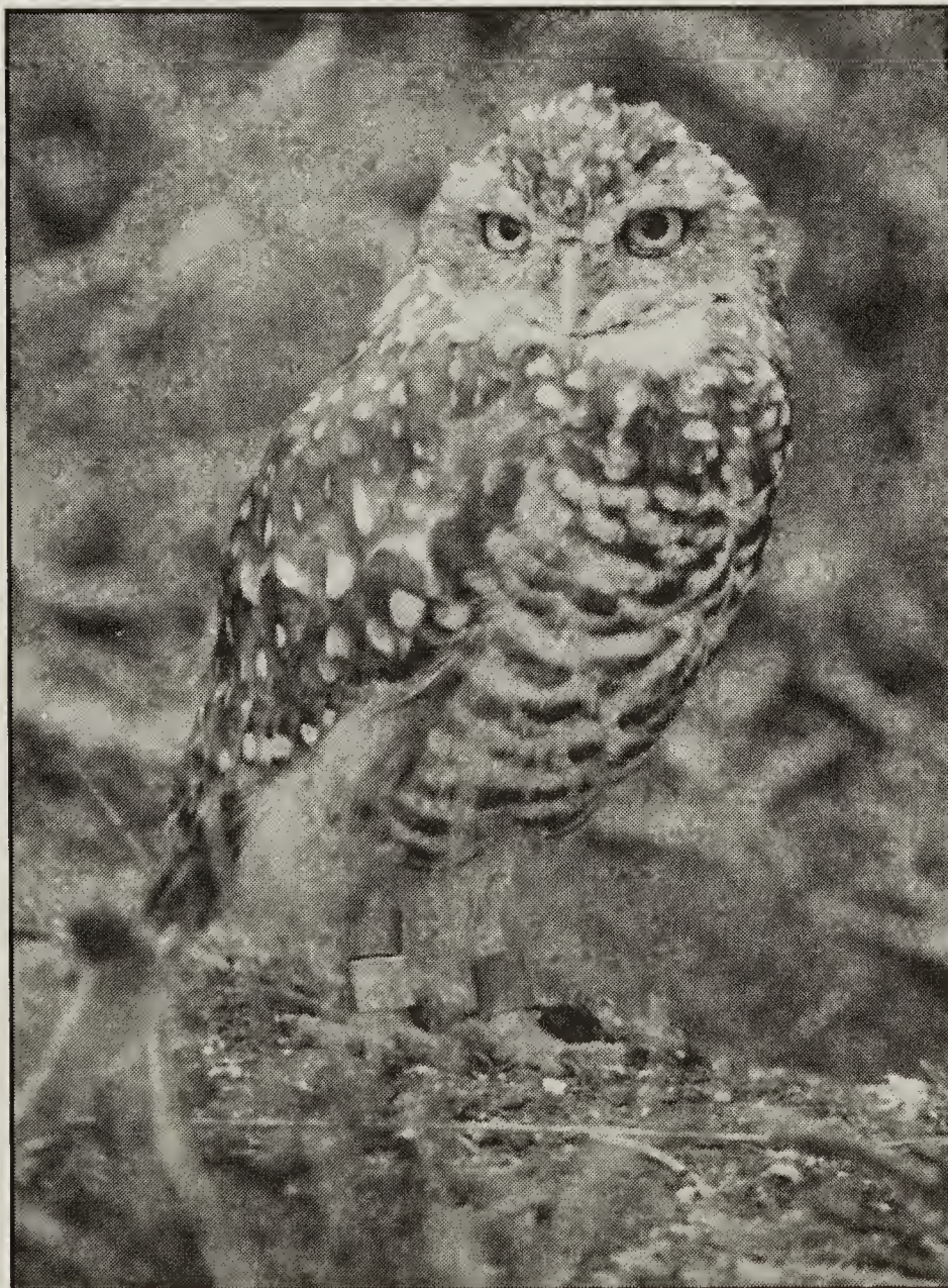
Burrowing Owl photographed on the grounds of the Saskatchewan Burrowing Owls Interpretive Centre in Moose Jaw in August 2003. The various color combinations of leg bands aid in identifying individual birds from a distance through binoculars or a spotting scope.