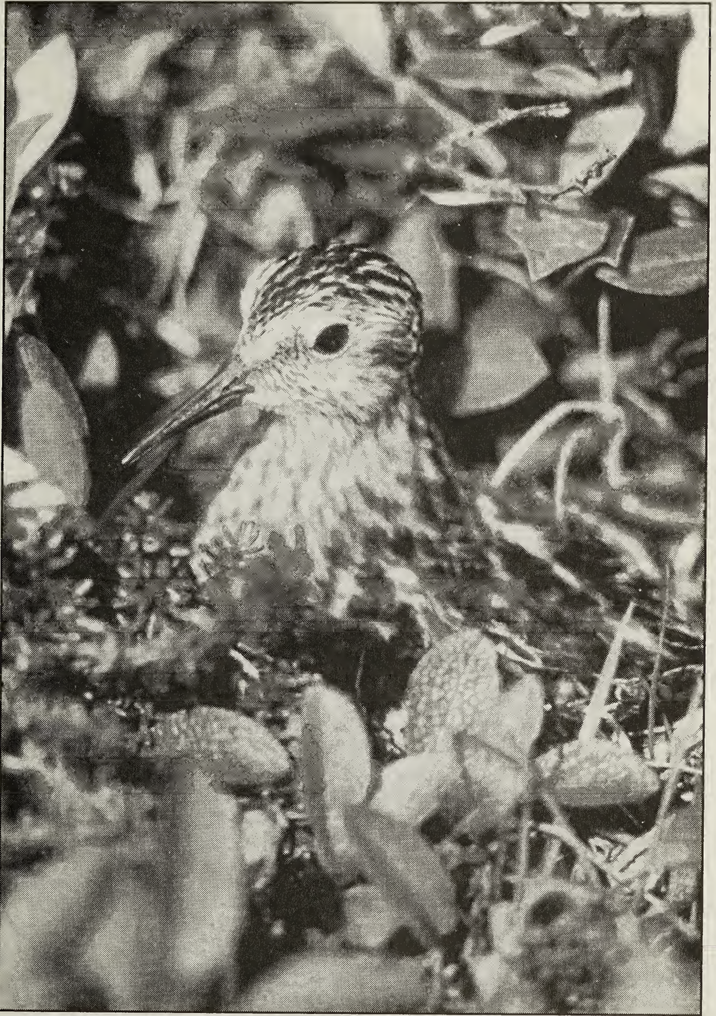
Least Sandpiper, incubating