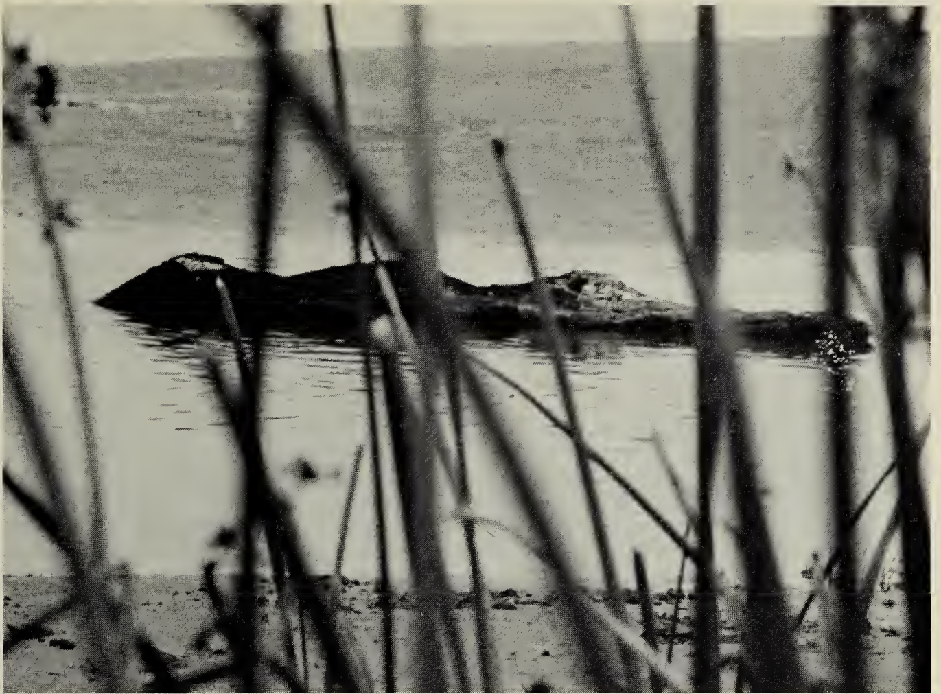
This is the well known South Saskatchewan River Crocodile. I found this to be the most common of all the species seen.