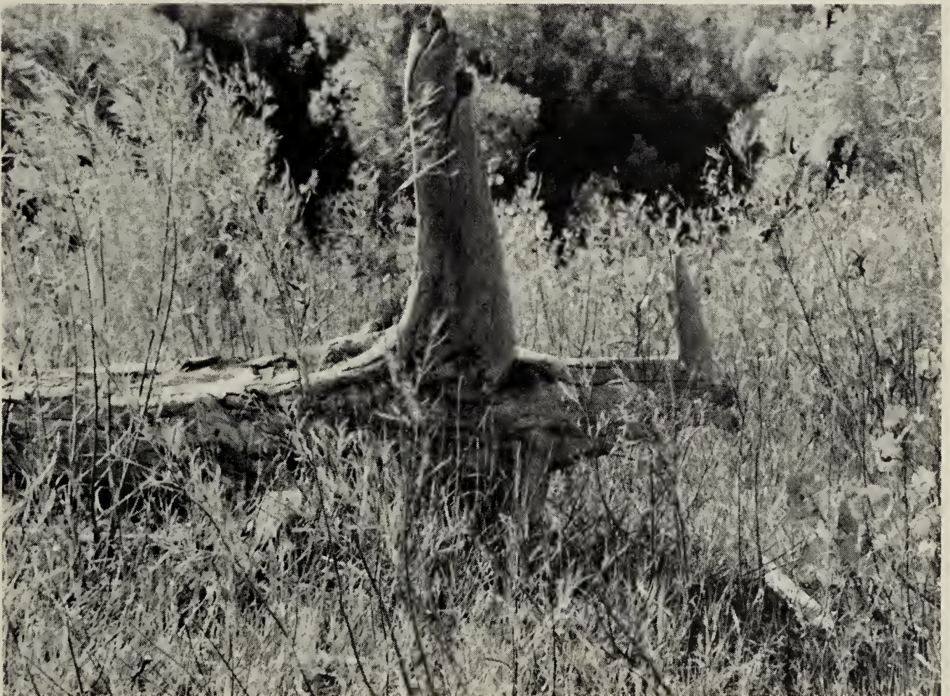
This was a big thrill for me - my first sighting of the Conehead Rhino. Because it was fall, which is their mating season, the forehead cone is in full display.