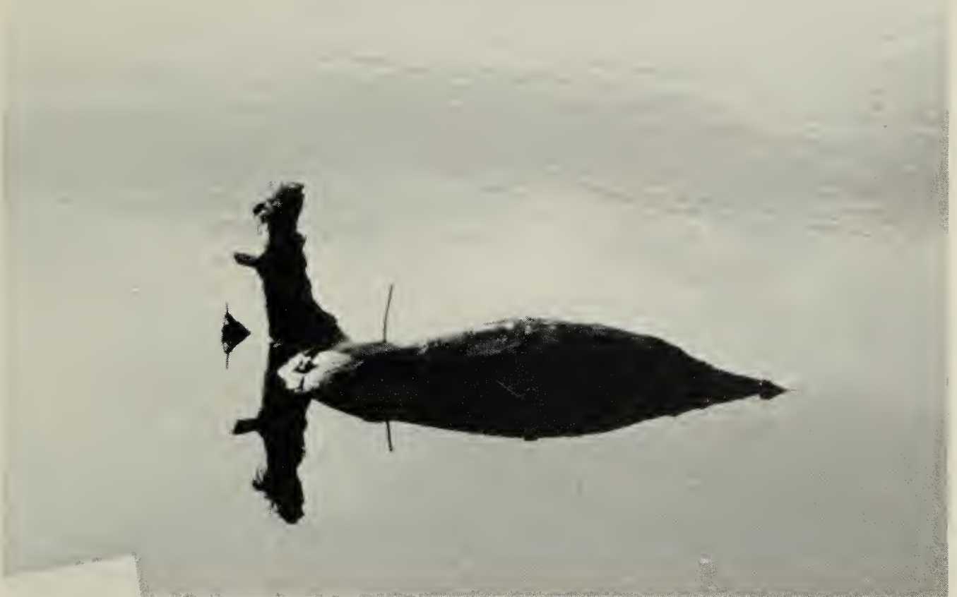
There were not many birds but here is an Aquatic Peacock.