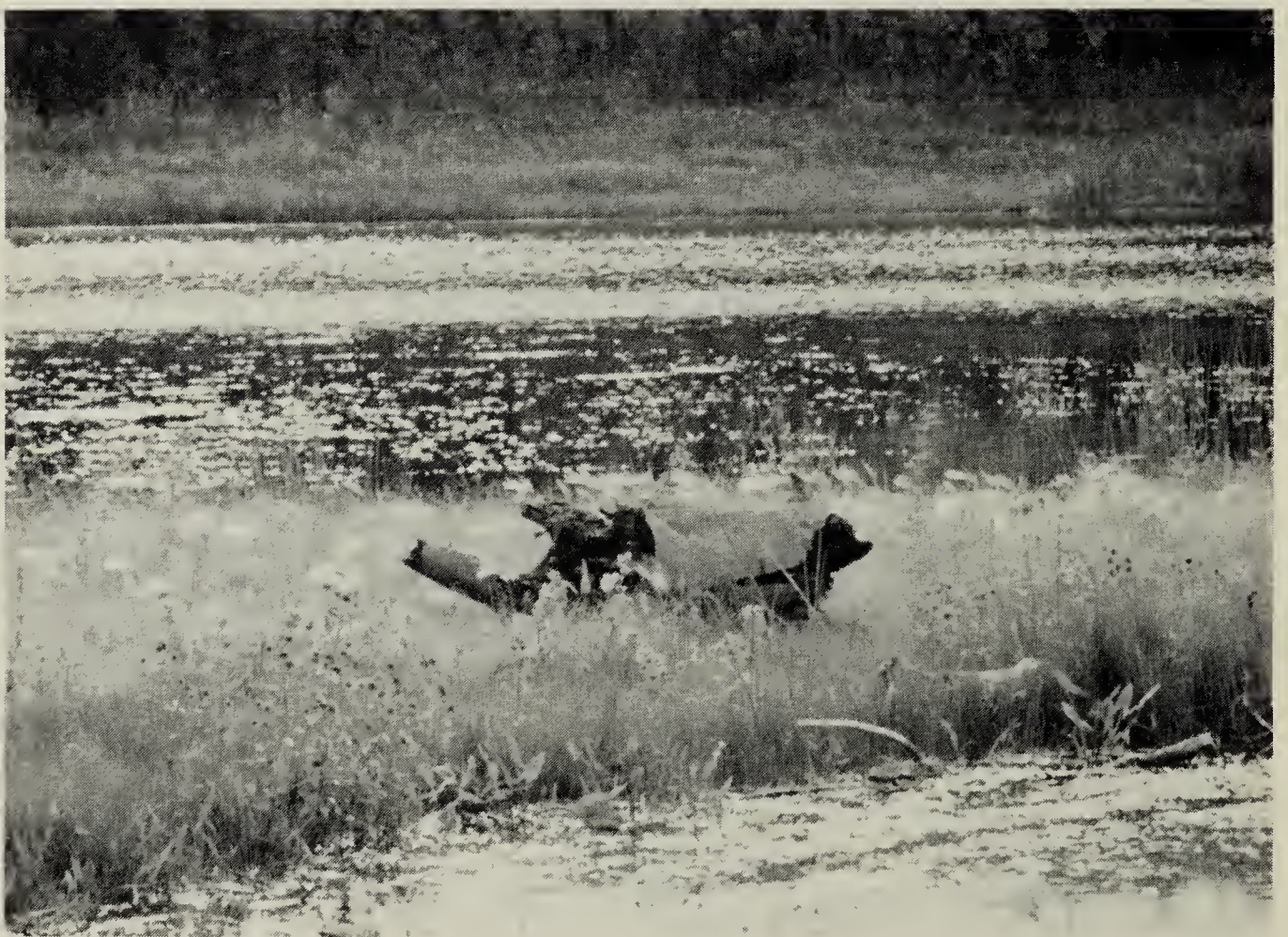
On a warm, sunny morning, a South Saskatchewan River Tortoise comes up on a sand bar to sun itself.