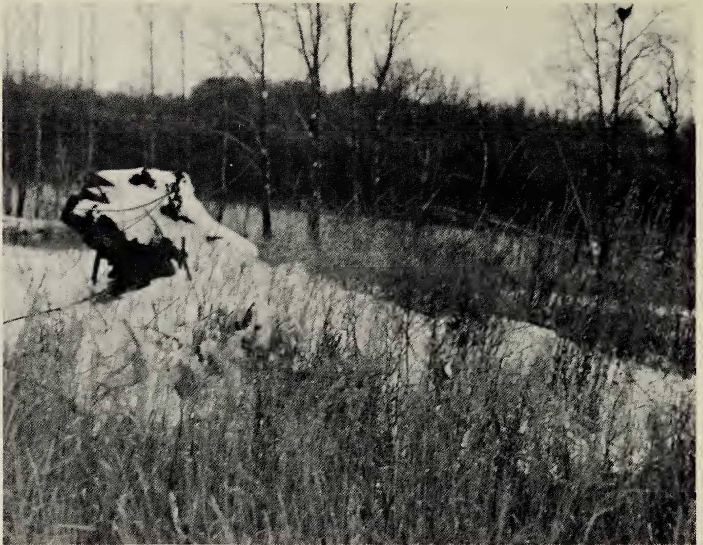
Proof to settle the age-old question: Do Cougars occur in Saskatchewan?