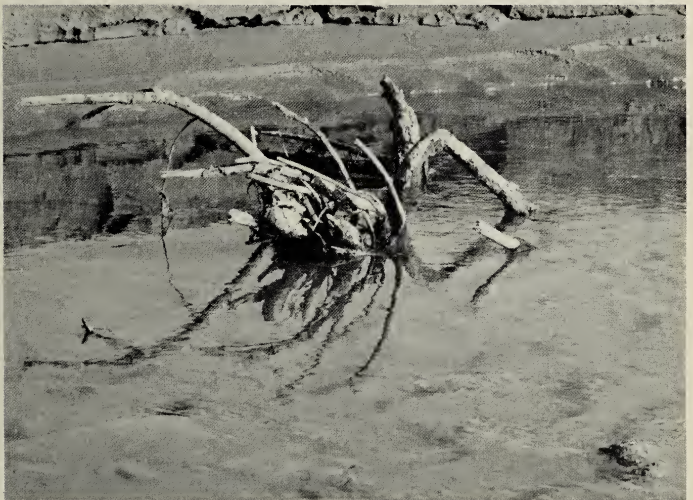
I also found a good many spiders of truly shocking size. This one is the Crab Spider. I didn't wait around for him to reach shore.