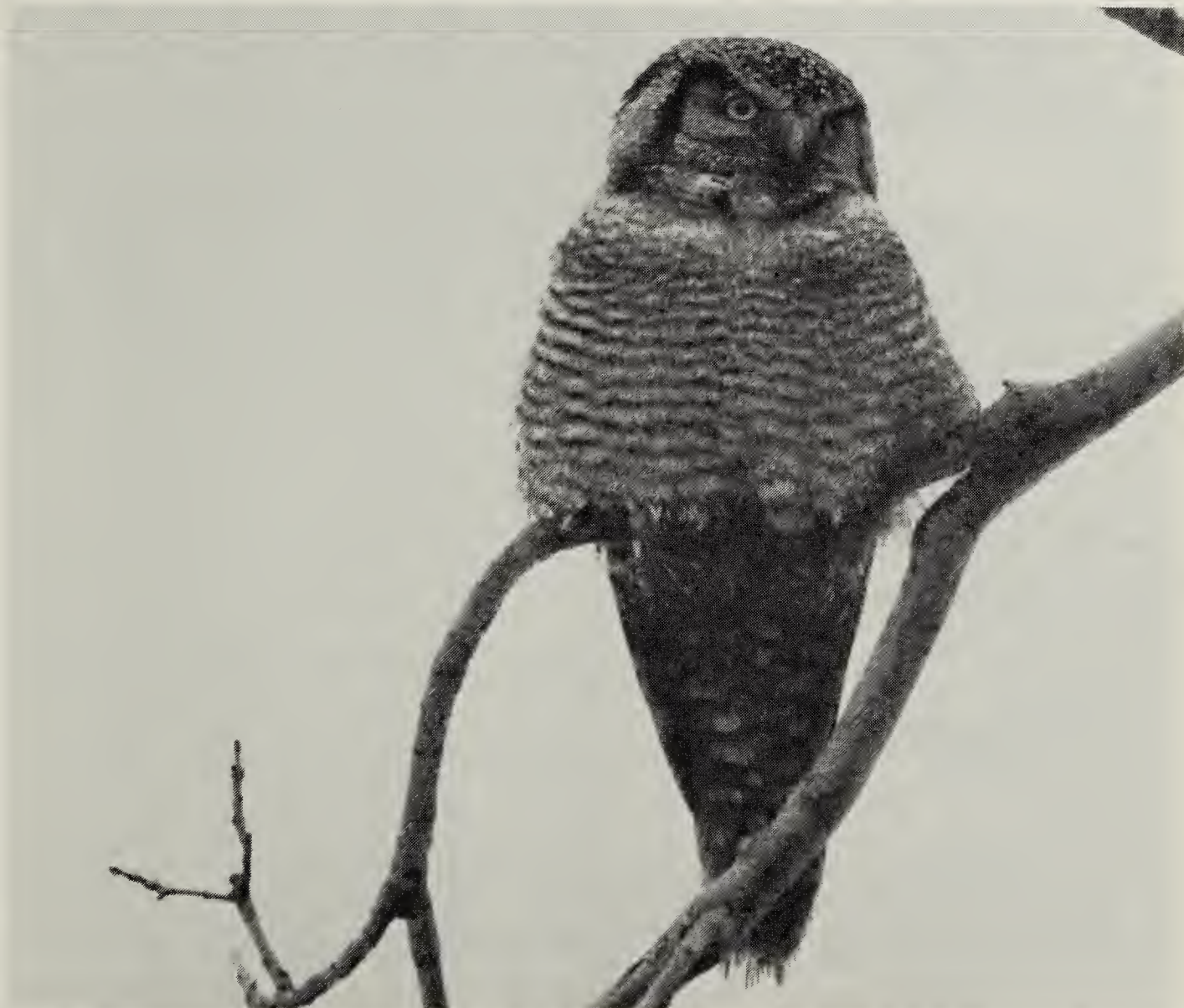
Northern Hawk Owl