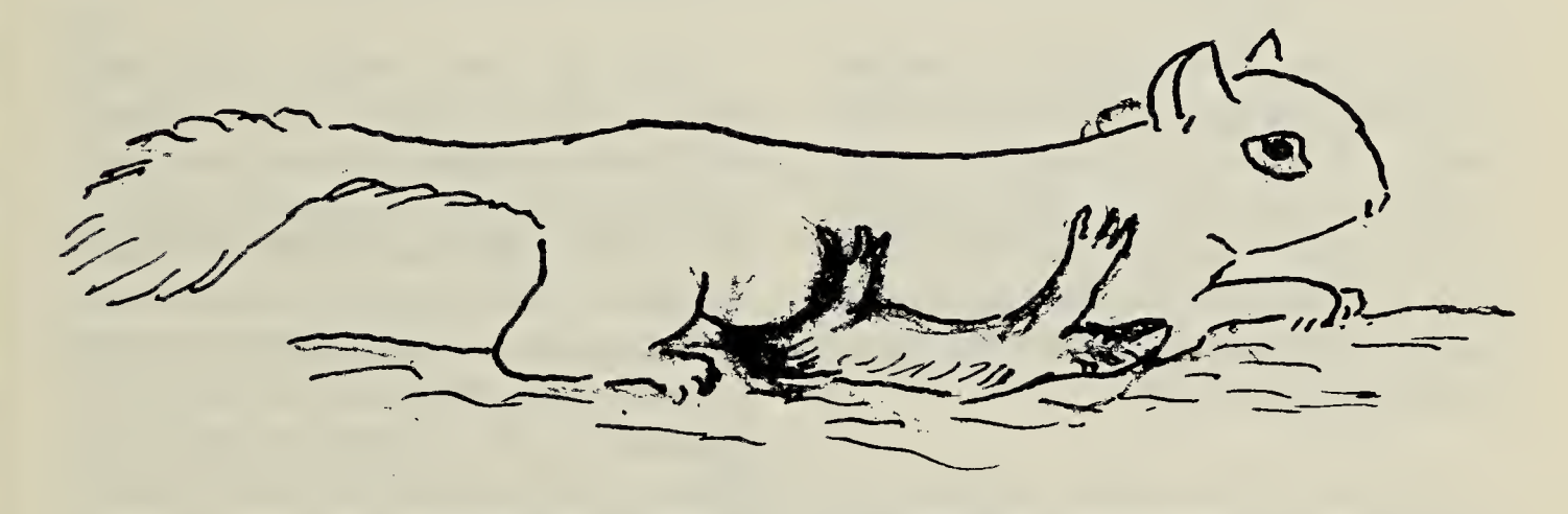
Figure 1. Adult American Red Squirrel with young clinging to its belly.