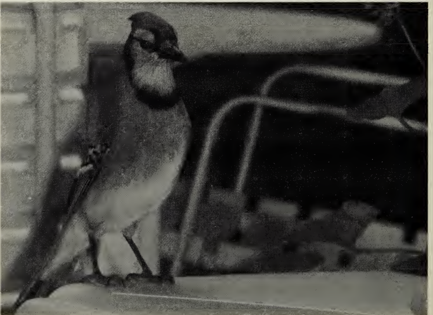
Just green seedless? No way!