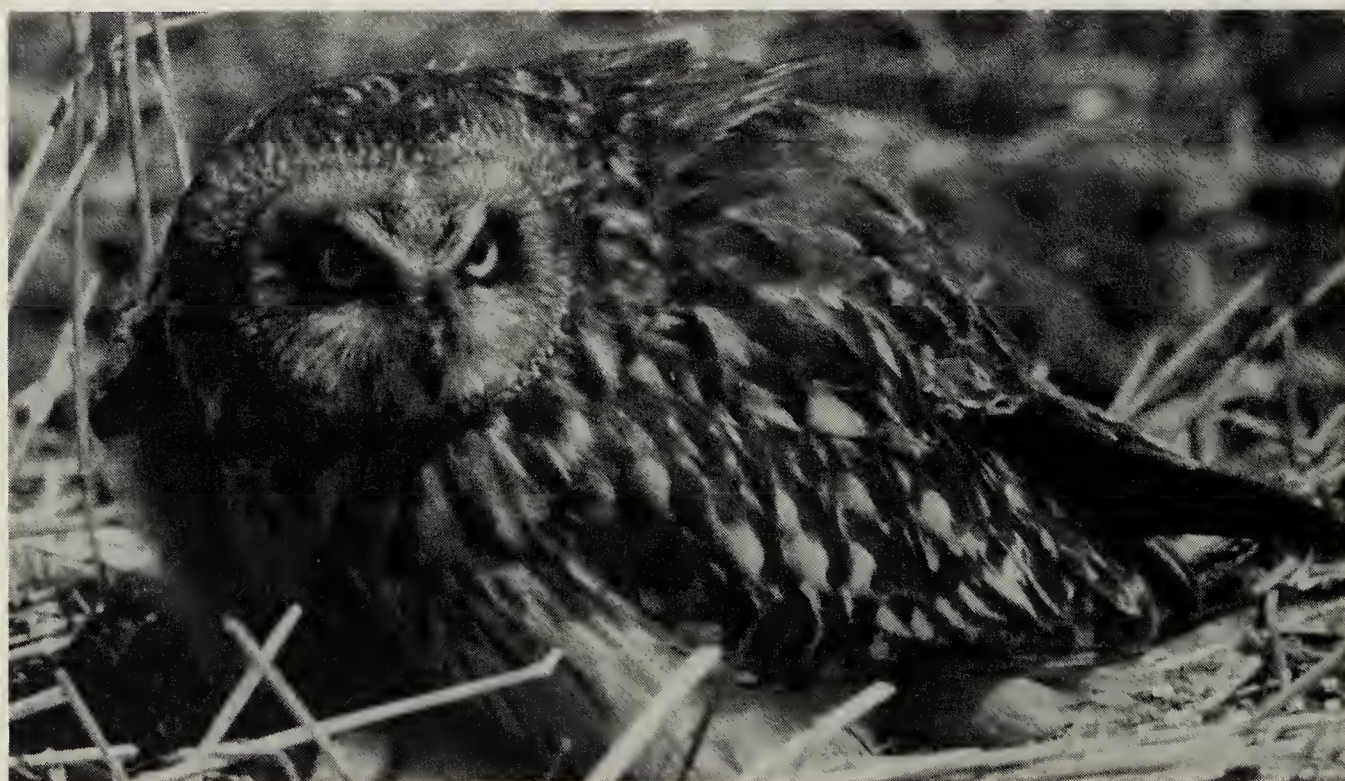
Short-eared Owl becoming more of a winter bird?