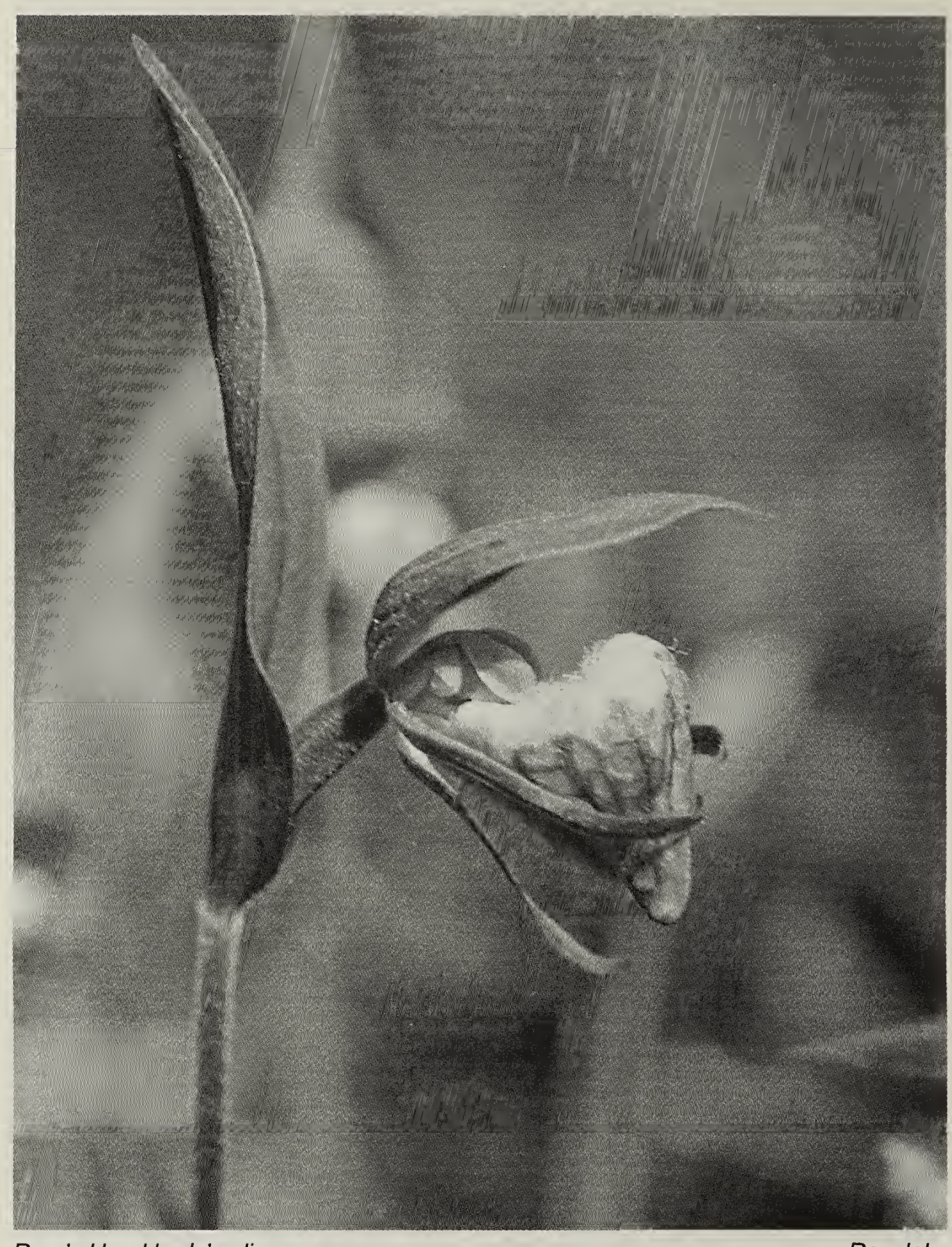
Ram's Head Lady's-slipper