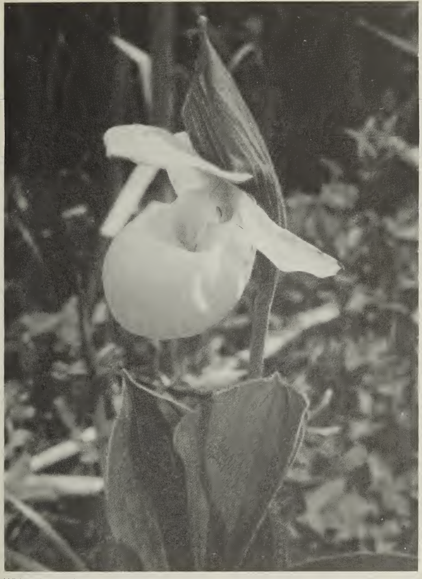
White phase of the Showy Lady