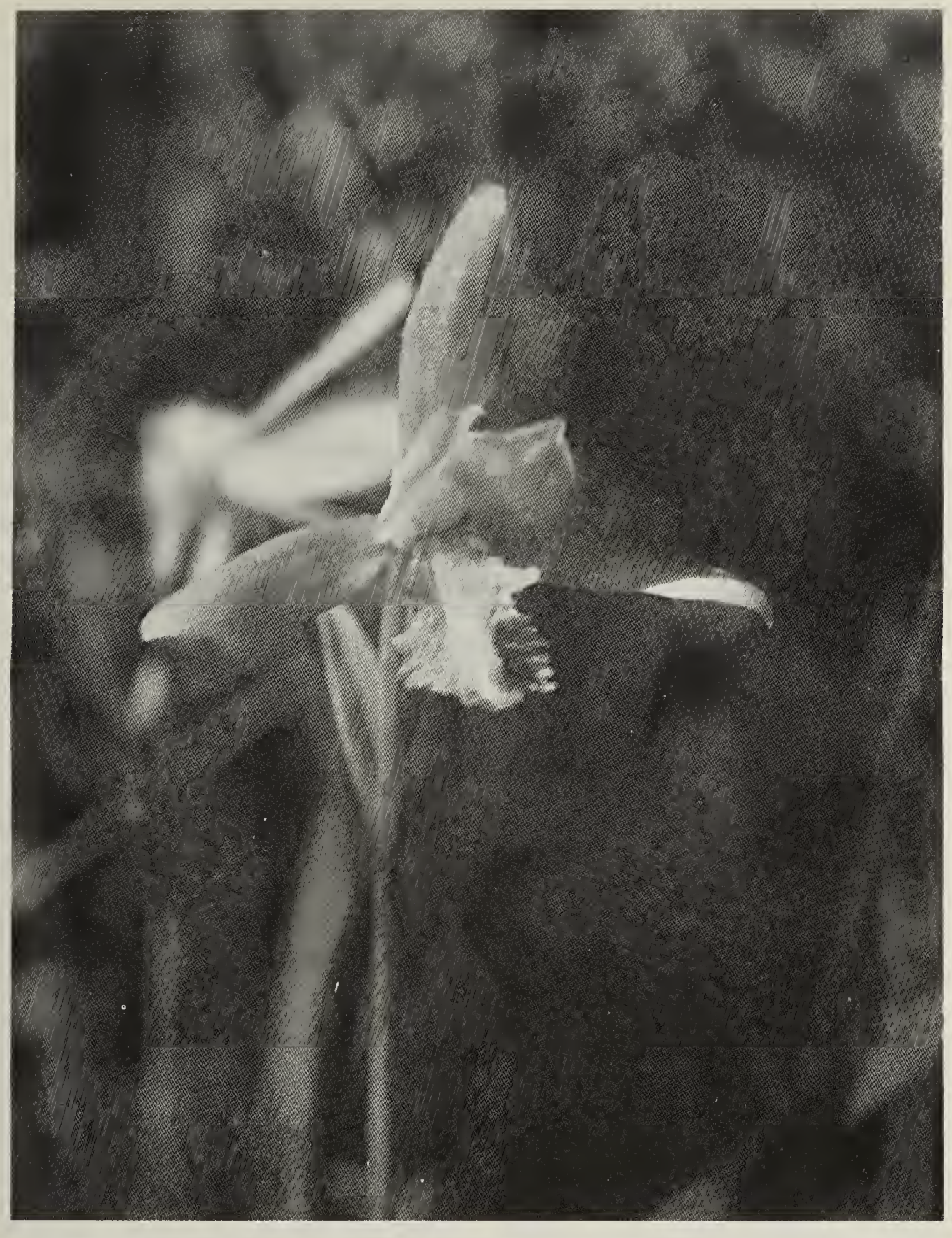
Rose Pogonia

escape an ardent river god's pursuit. Dragon's Mouth has been found in the Hudson Bay area of Saskatchewan and in a few places in Manitoba, but it is very rare. Mostly an eastern species, its range extends throughout the Atlantic provinces, Quebec and Ontario and reaches its western limit in our area.