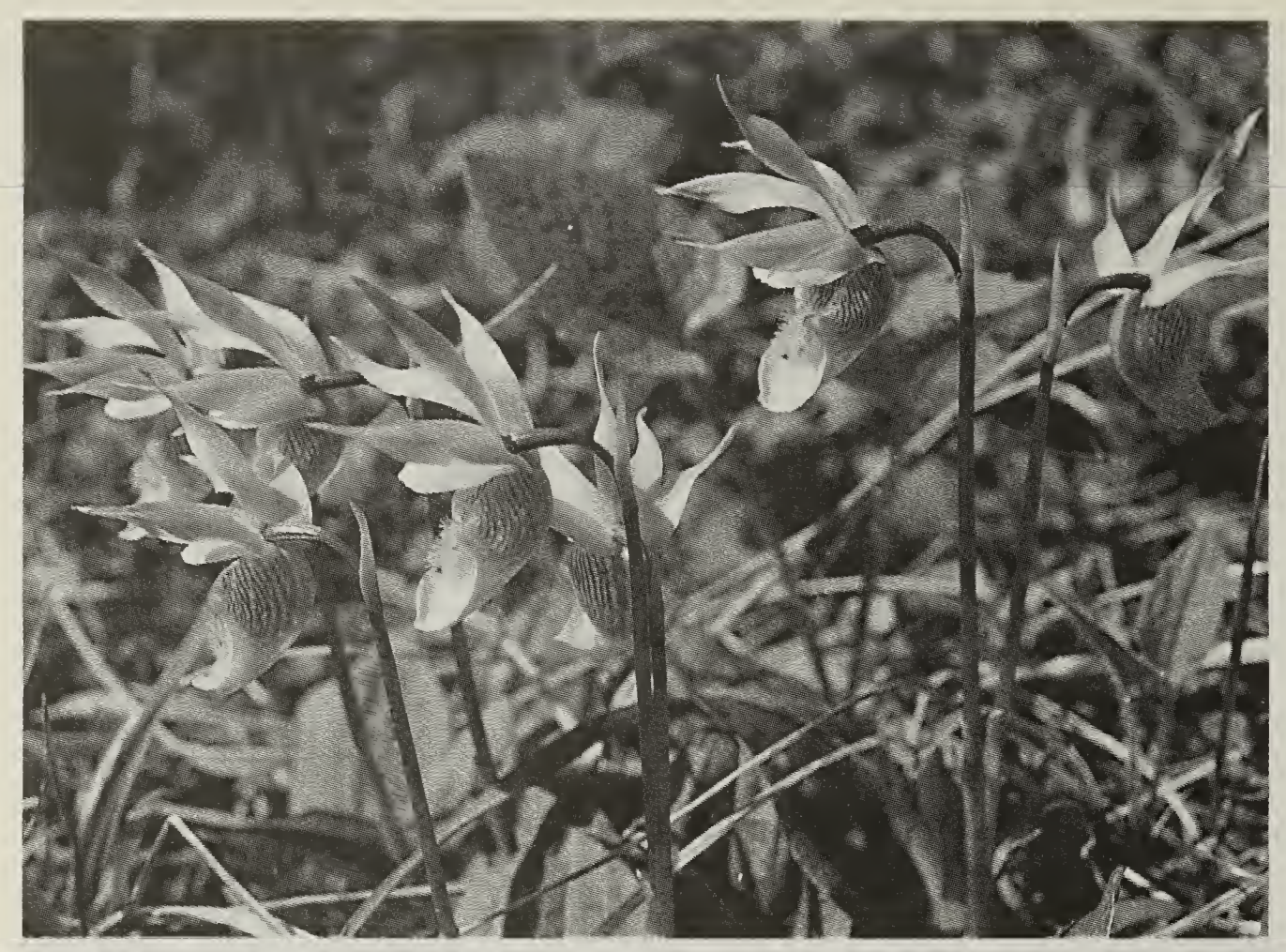
Calypso Orchid, Banff