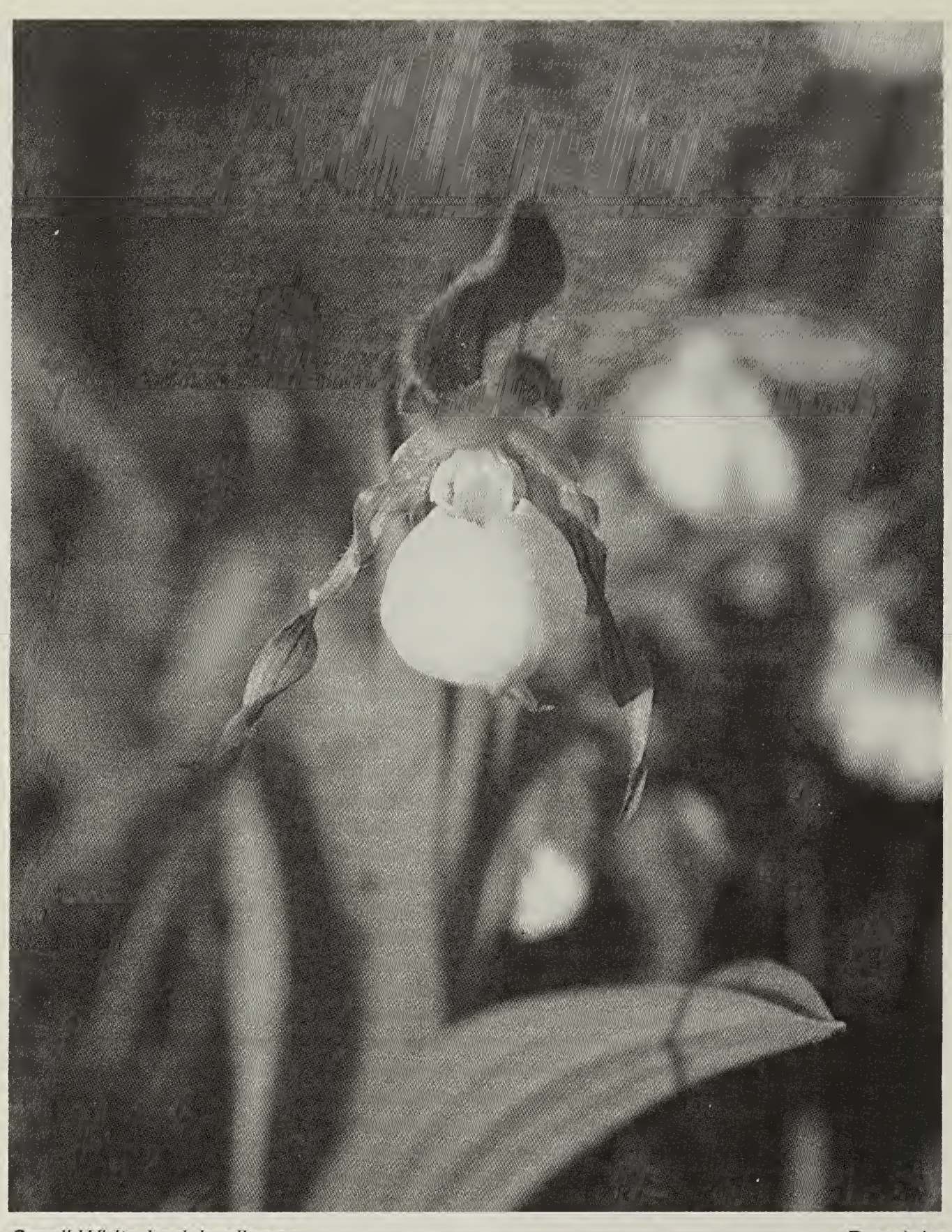
Small White Lady's-slipper