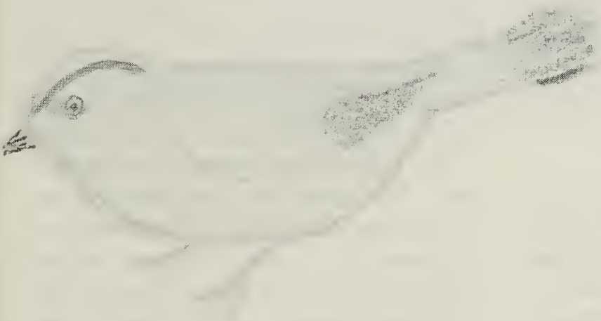
Partial albino White-throated Sparrow, 1991. Flossie Bogdan