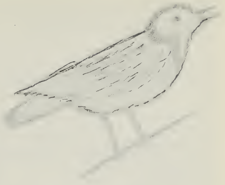
Partial albino starling on power line, 1990. Flossie Bogdan