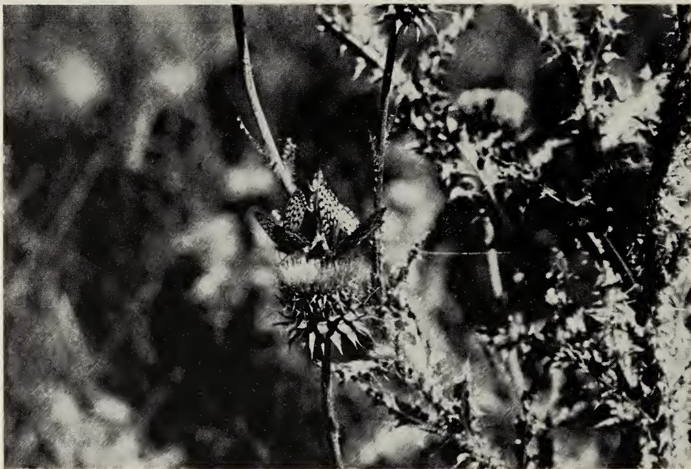
Great Spangled Fritillary (right) and Northwestern Silverspot (left) J.B. Collop

GREENISH BLUE — Plebejus saepiolus amica (W.H. Edwards)