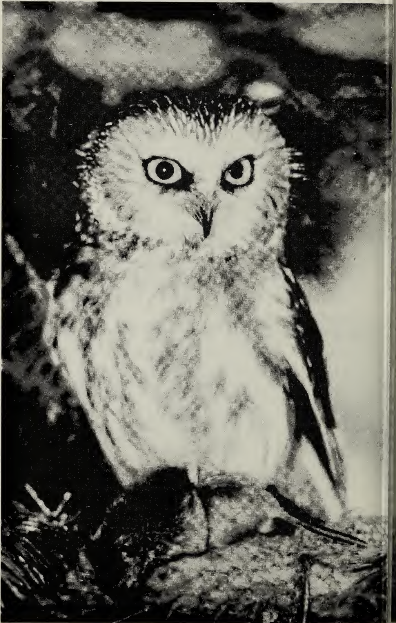
Northern Saw-whet Owl with House Mouse