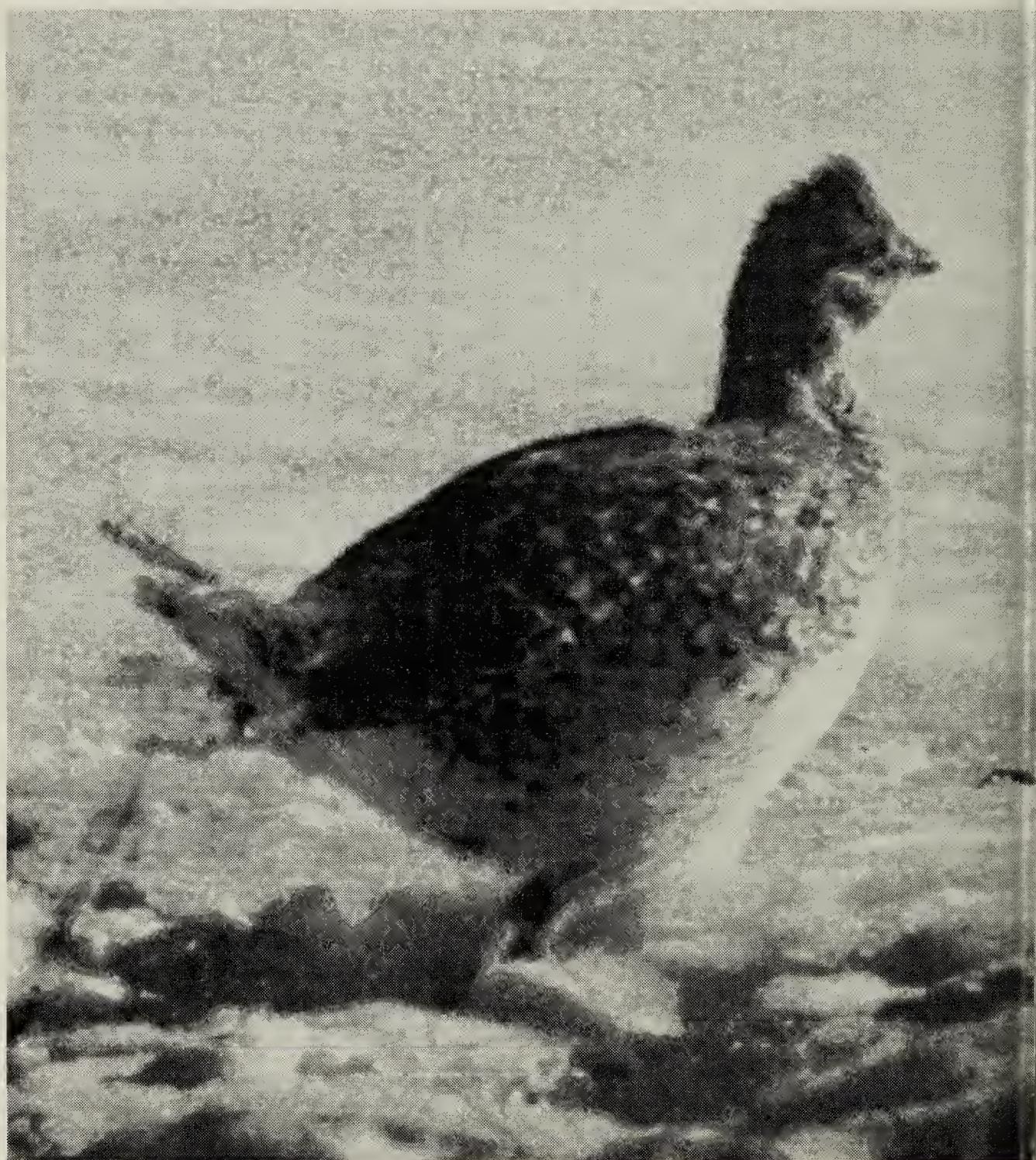
Sharp-tailed Grouse near Sylvania, Saskatchewan