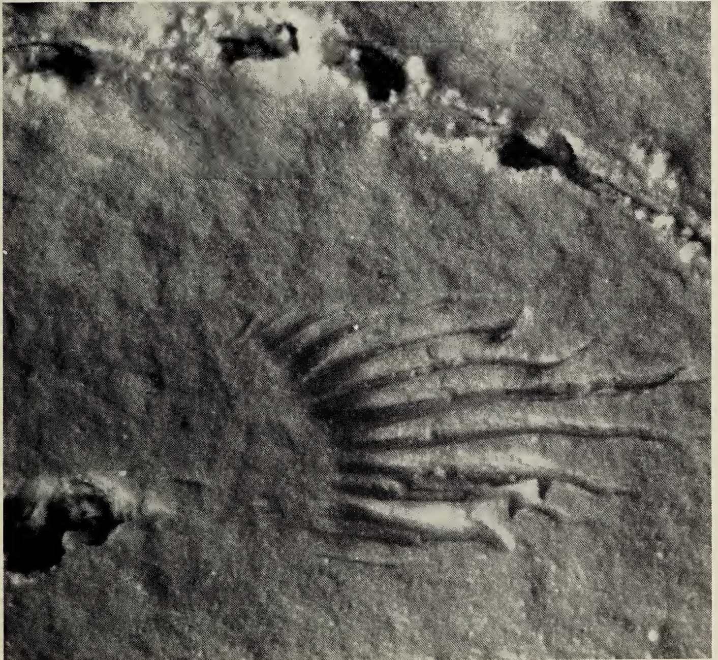
Pheasant tracks in snow