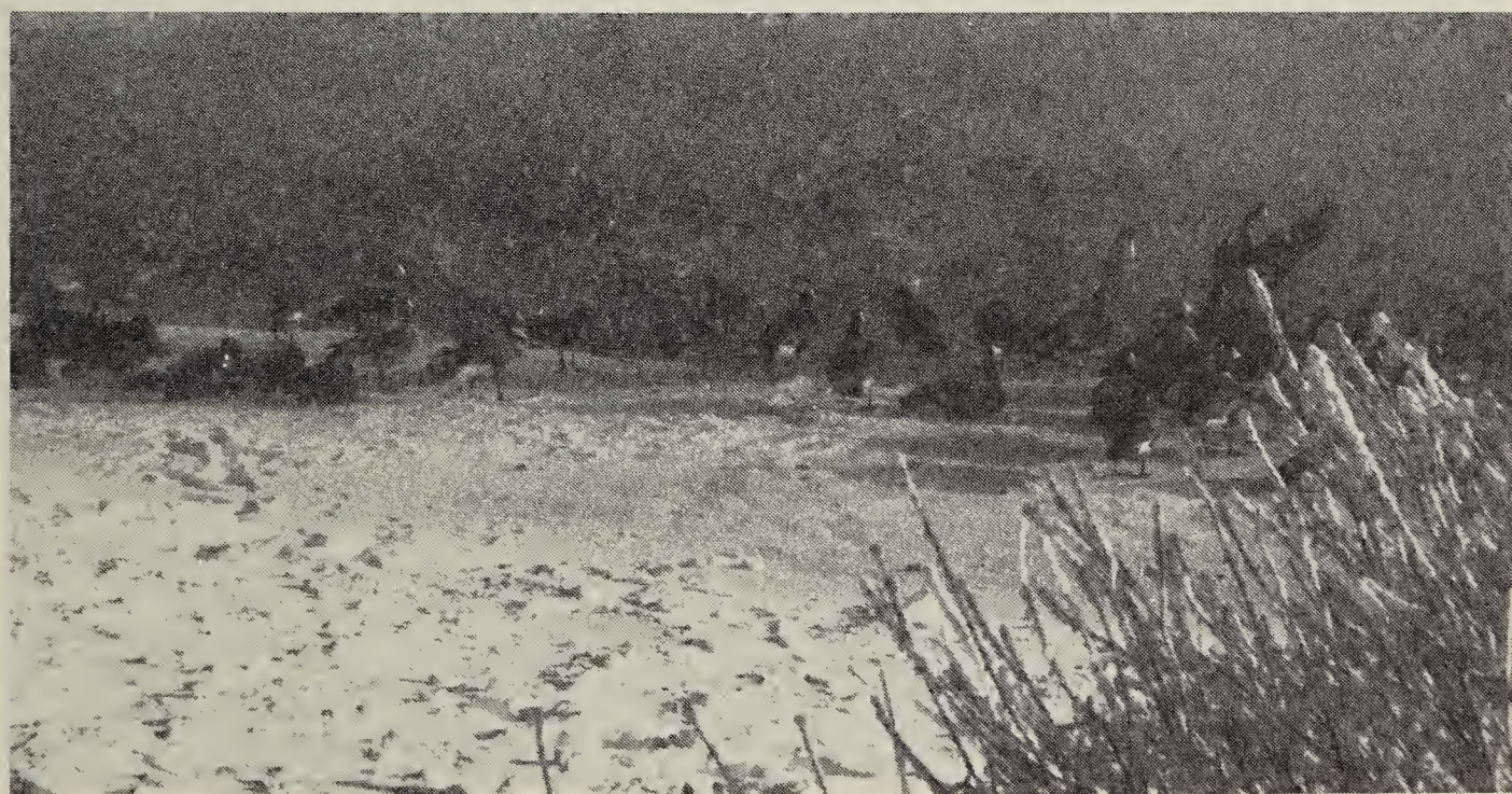
Canada Geese, Wascana, 1978