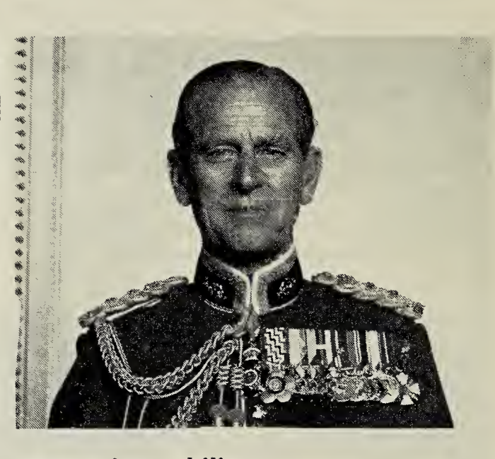
HRH Prince Philip