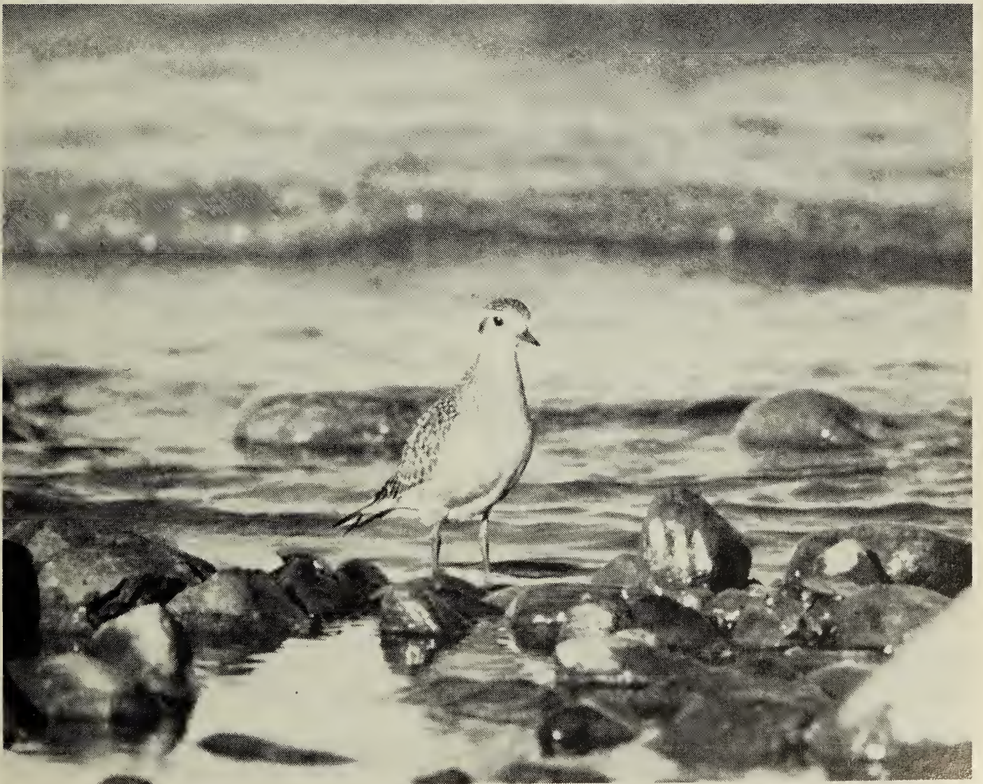
Autumn, immature American Golden Plover