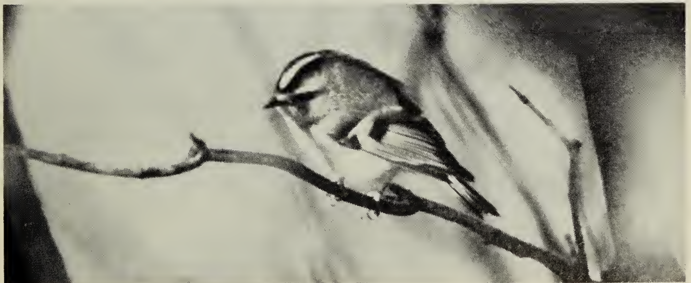
Golden Crowned Kinglet