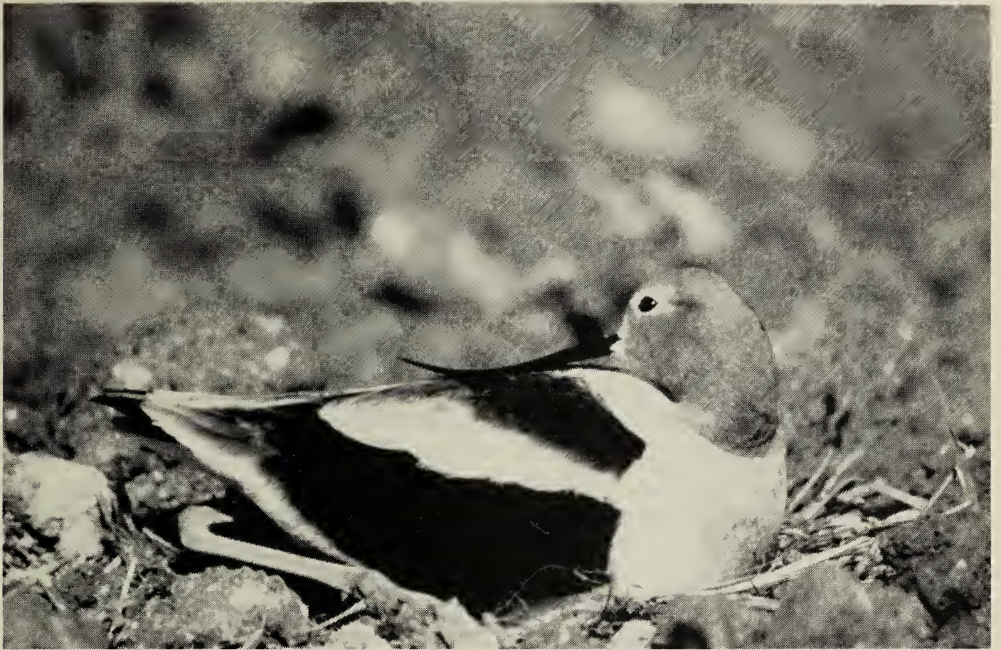
American Avocet on nest