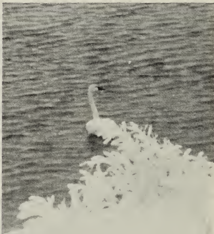
Trumpeter Swan at Squaw Rapids power-channel 24 December 1986