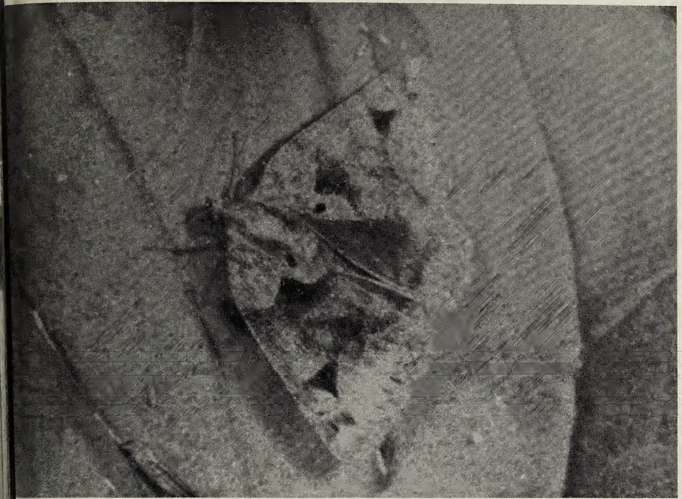
Painted Grass Moth, Mistatim, June 1981