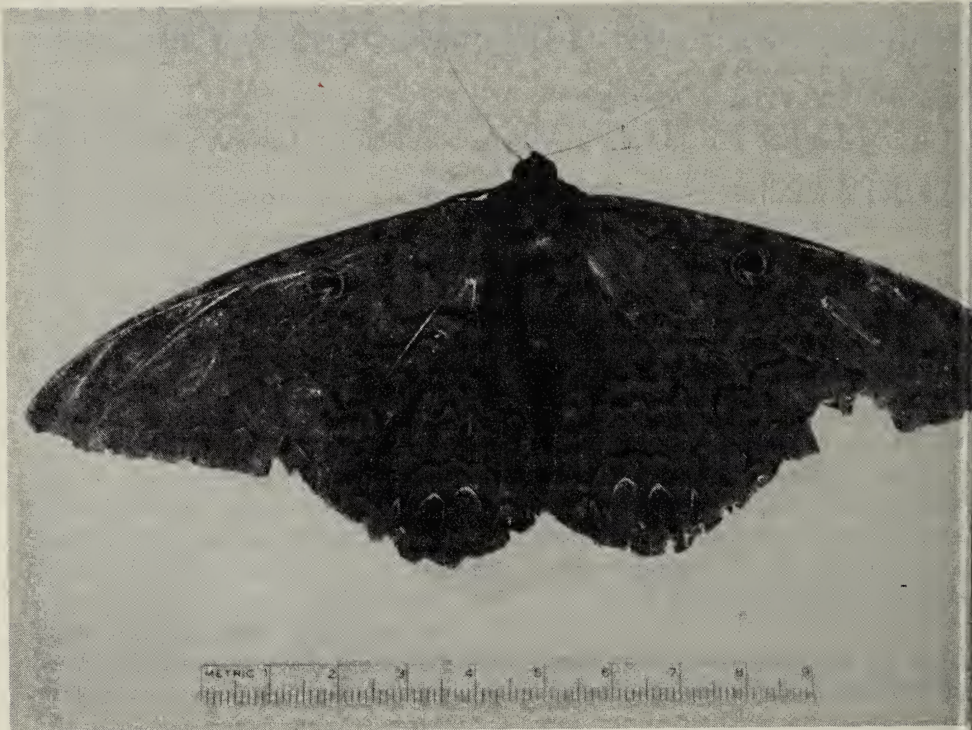
Black Witch Moth, 31 July 1986, Regina