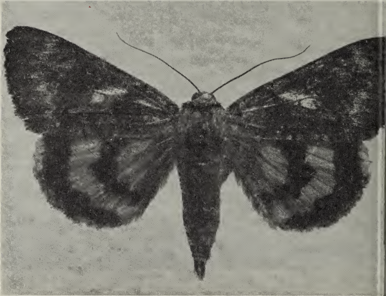
Sweetfern Underwing, Bjorkdale, 14 August 1989