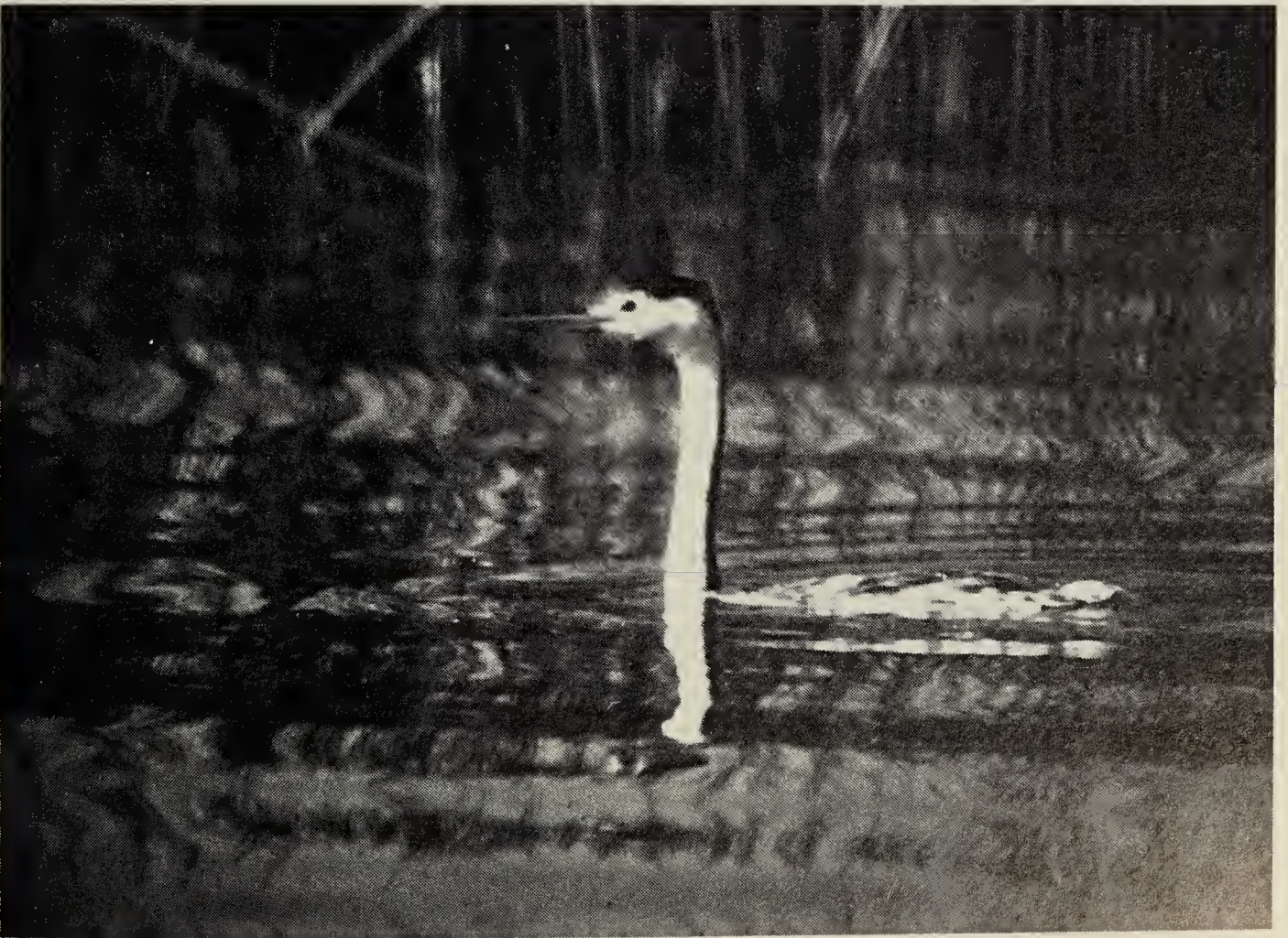
Figure 1. Clark's Grebe near nest (upper); second Clark's Grebe (lower).