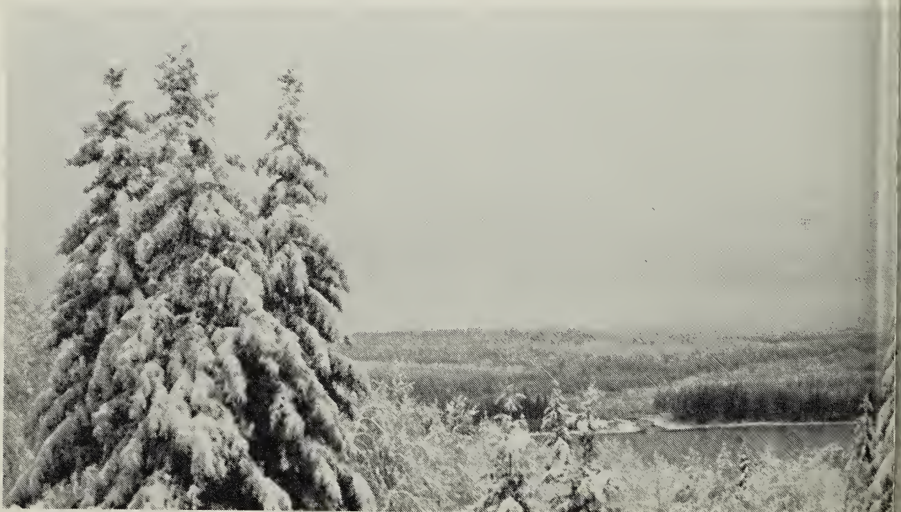
Prince Albert National Park "from atop Shady"