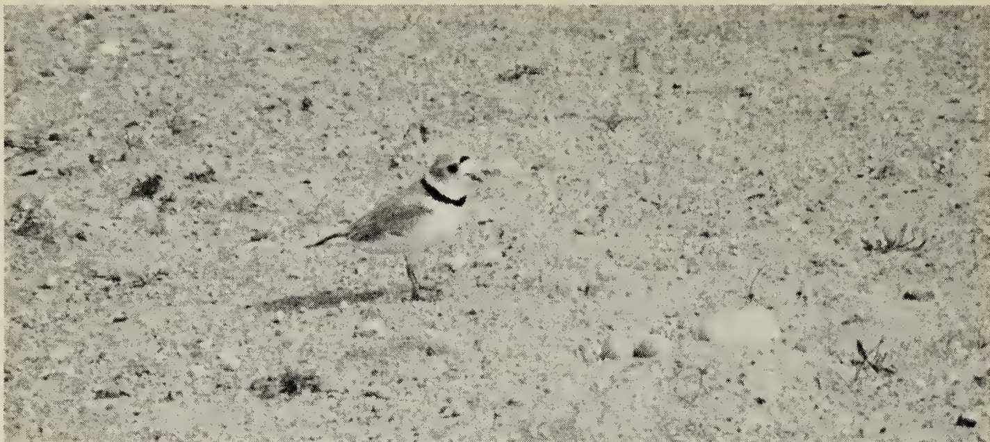
Piping Plover — Manitou Lake, Saskatchewan.