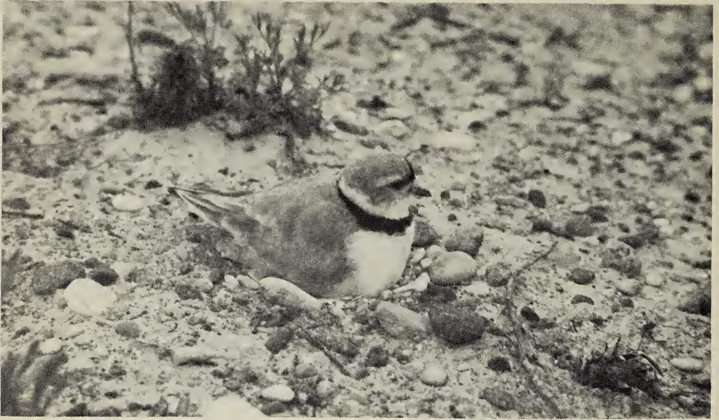
Piping Plover on nest.