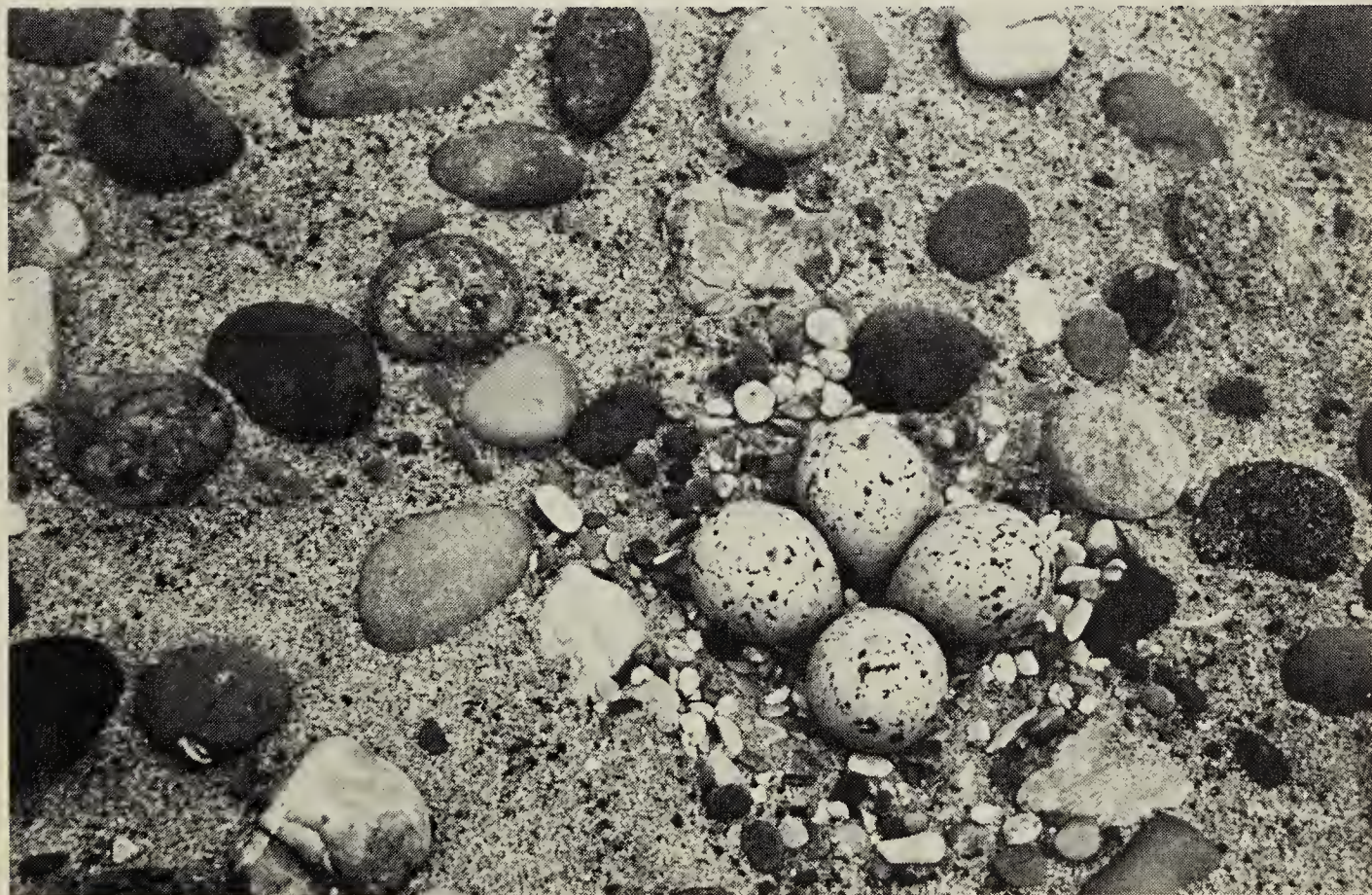
Piping Plover nest — Long Point.

Several authors have alluded to the necessity of wide, deserted beaches as nesting habitat requirements for the Piping Plover. 6 16 19 Fortunately on many of the lakes in Alberta, where relatively large numbers of plovers nest, there is little, if any, (present) threat of habitat destruction. By current standards these lakes are too isolated from population centres, too alkaline and too shallow for much recreational development. However, a shoreline park and small boat access were developed on Buffalo Lake prior to this study and reportedly displaced a number of pairs of Piping