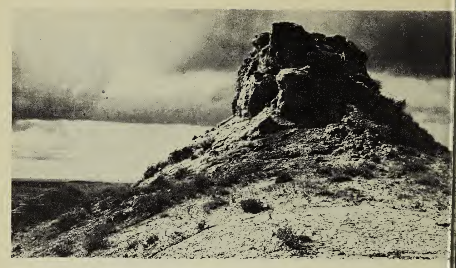
Clay hilltop, Killdeer Badlands, Grasslands Park.