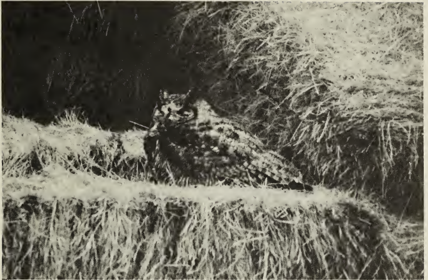
Great Horned Owl, Fort Walsh C.B.C., 1984