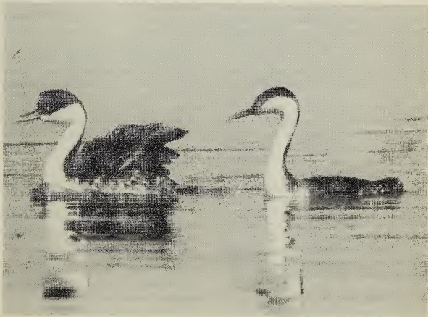
Western Grebes (dark-phase)

16 WILLIAMS, S.O., III. 1982. Notes on the breeding and occurrence of Western Grebes on the Mexican plateau. Condor 84:127-130.