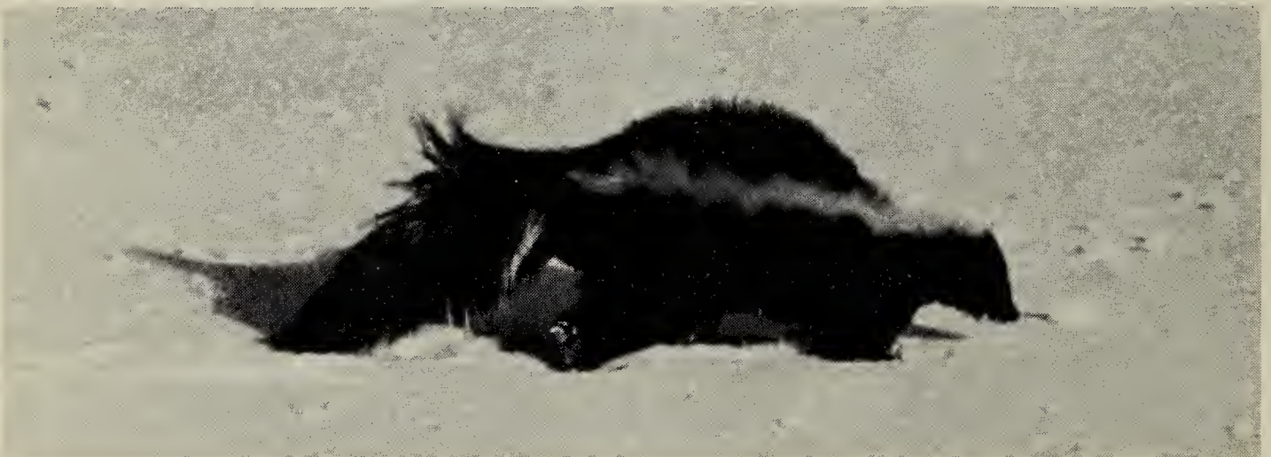
Skunk in snow