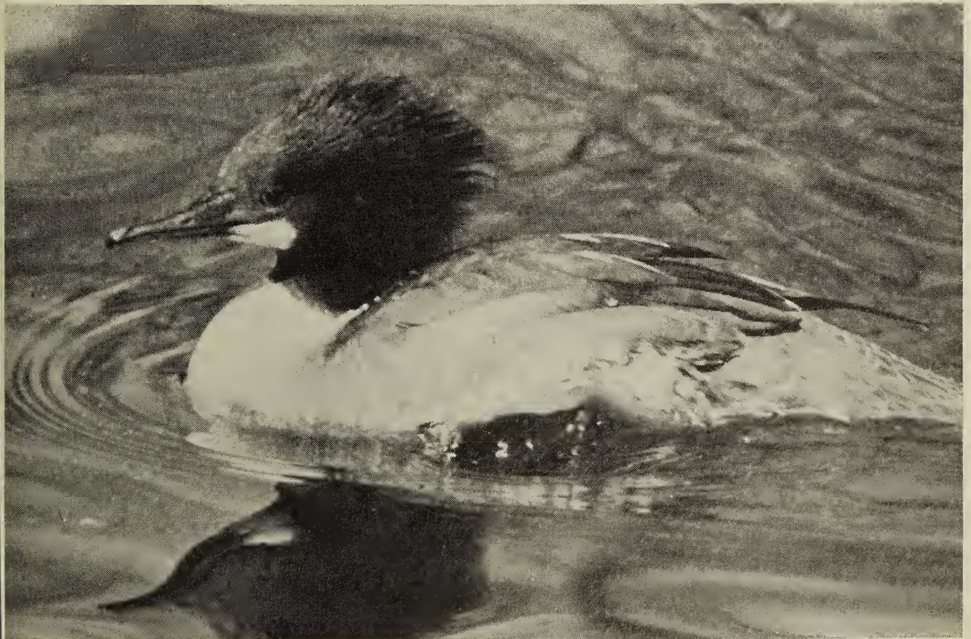
Female Common Merganser