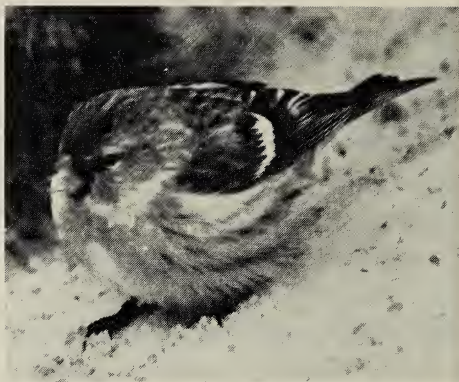
Common Redpoll.